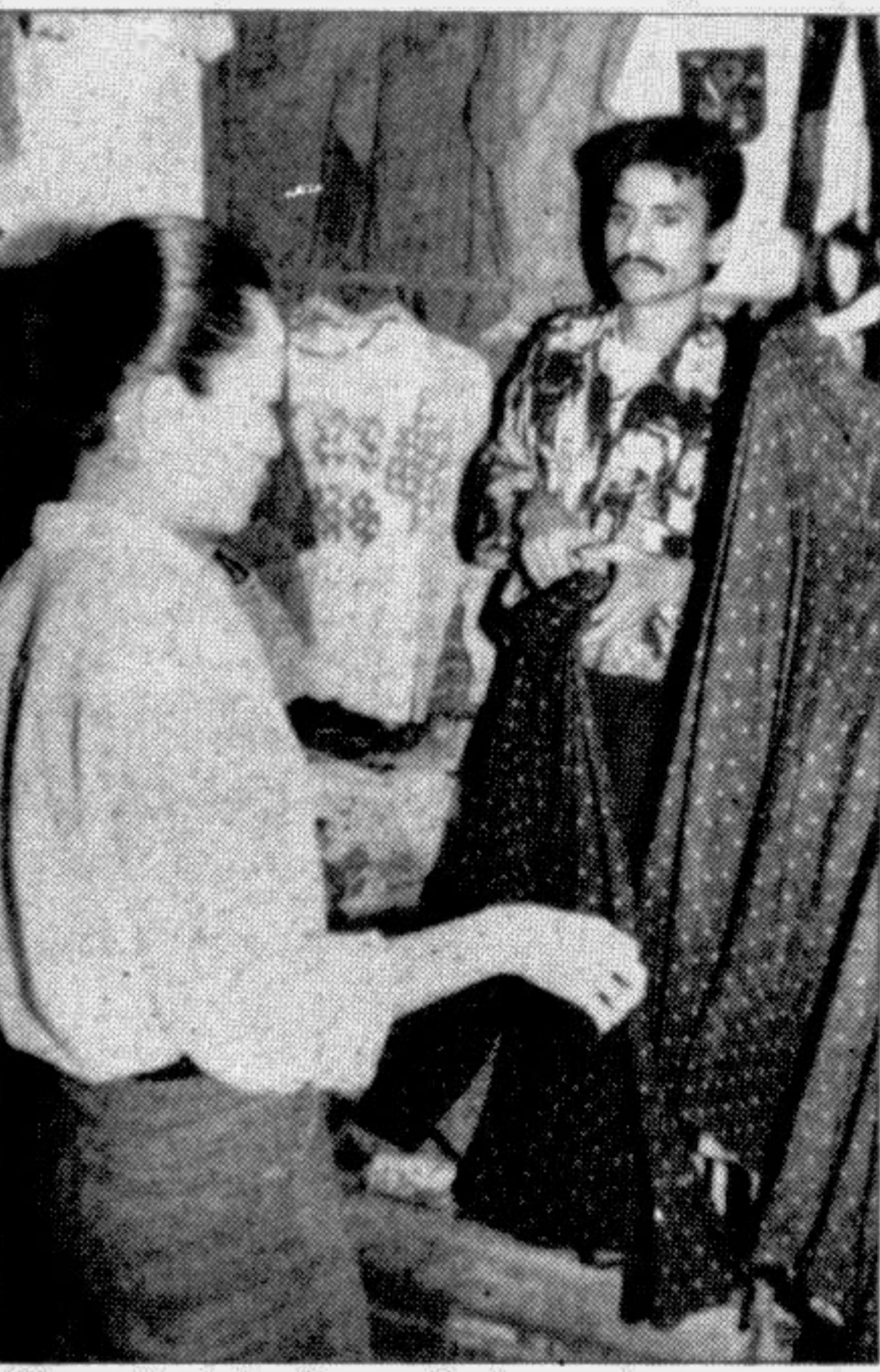
The motto is to please a foreign customer.

The rich may not be particularly interested in this Hawkers' market, but foreigners don't mind frequenting the shopping mall. The salesmen are always ready to please these customers of foreign climes and hardly have equal endearing greetings to treat the local customers with. Bangabazar is a bit discriminatory but that is how things are. After all money does not only buy, it also speaks.