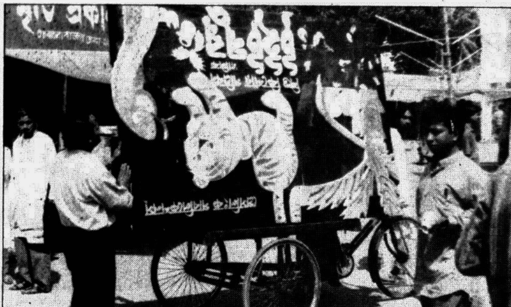
As the month-long book gala show popularly known as Boi Mela ends at the Bangla Academy premises yesterday, publishers and organisations are seen packing up their belongings.