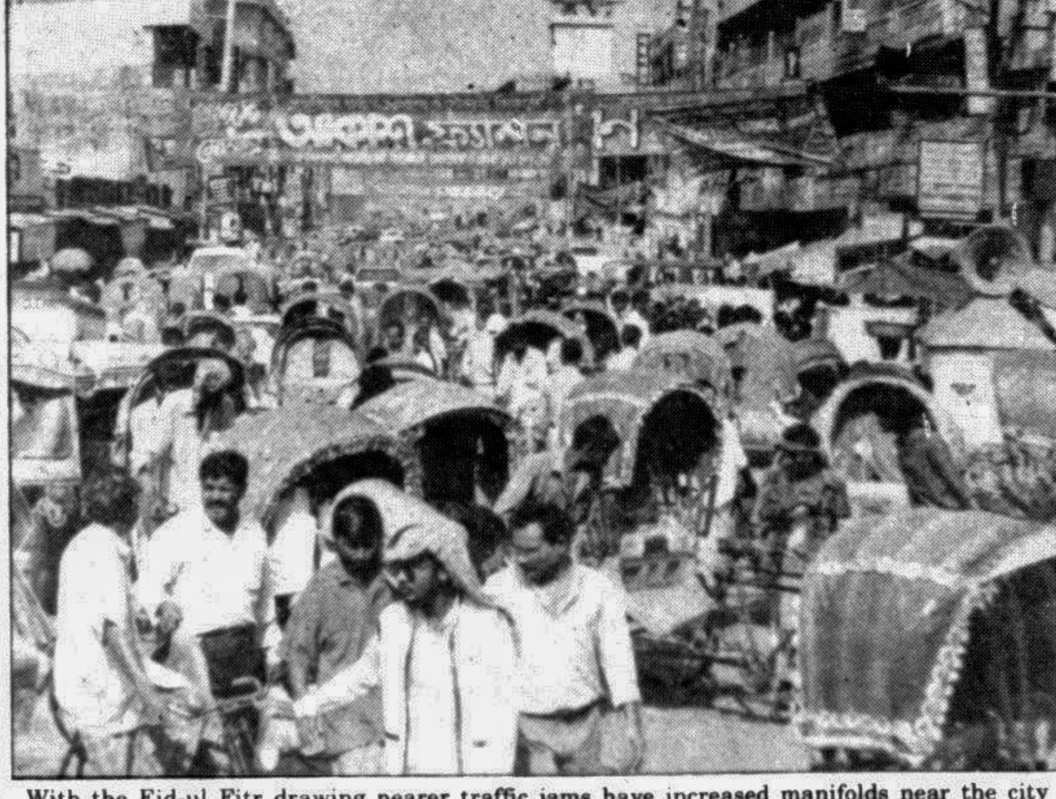
With the Eid-ul-Fitr drawing nearer, traffic jams have increased manifolds near the city shopping centres. This picture was taken yesterday near the Gausia Market.