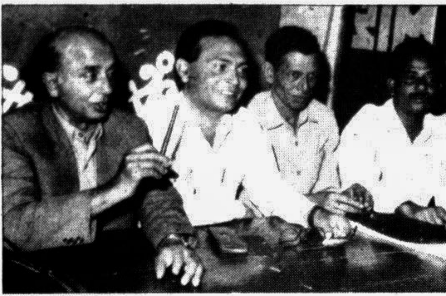
Leaders of the Patkal Sramik Karmachari Sangram Parishad (Jute Mills Workers' Employees Action Council) at a press conference yesterday at its office.