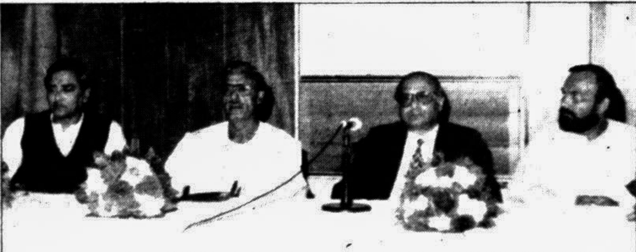
The Bangladesh Jatiyatabadi Muktiyoddha Dal accorded a reception to the Tribal Repatriation Committee of Chittagong Hill Tracts at the auditorium of National Sports Council yesterday. Seen seated (from L to R) are Rashed Khan Menon MP, Communications Minister Oli Ahmed, LGRD and Cooperatives Minister Abdus Salam Talukder and Minister of State for Sports and Youth Sadeq Hossain.

She describes her excursion to Chittagong which starts off as a fun trip but ends up in her shocked realization that the hills have been stripped of their green forests by indiscriminate felling. She criticizes the people responsible and appeals to the government to take action against them.