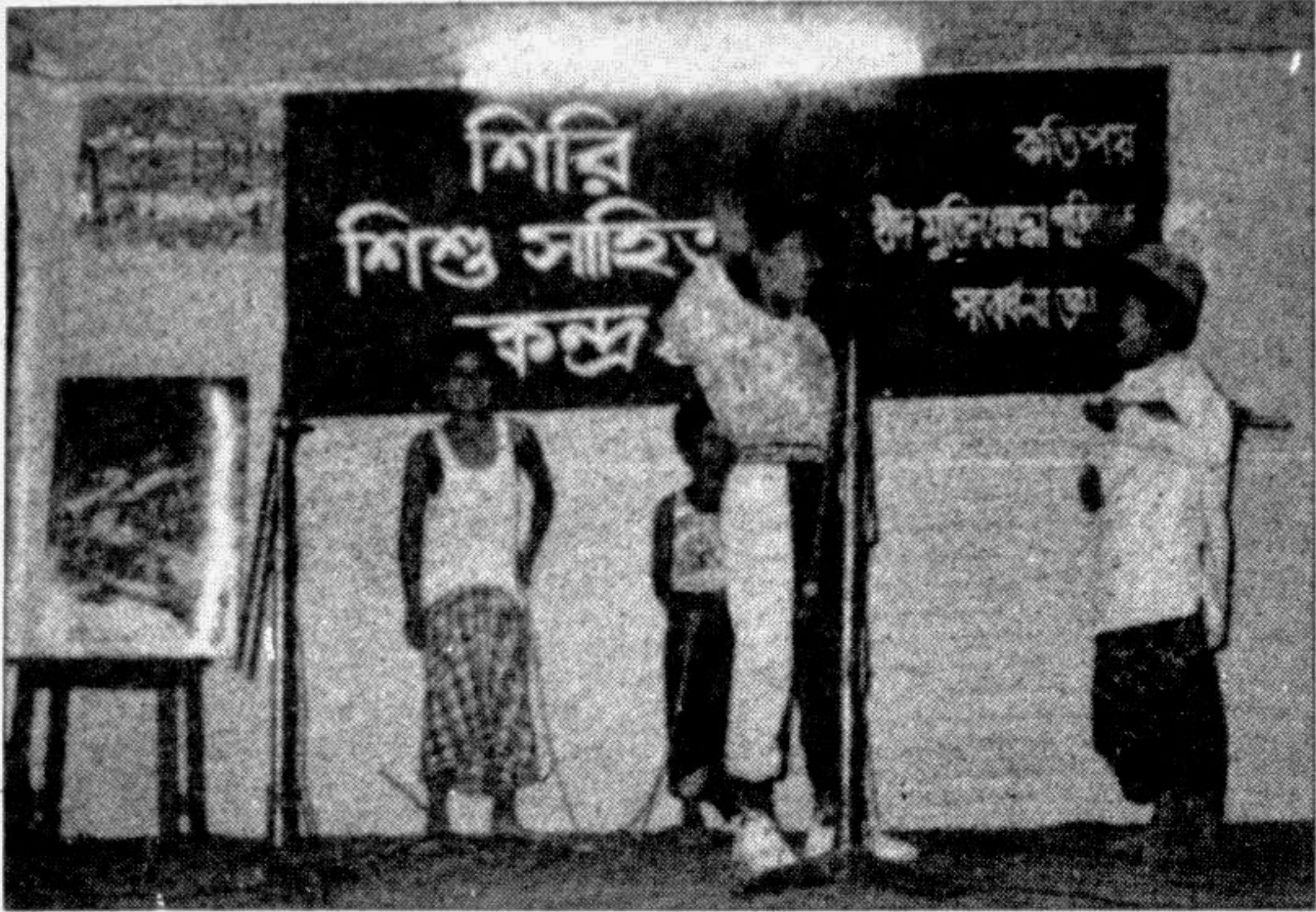
Children are seen participating in the short drama 'Sadeq Ali' in the function arranged for reception of 12 Shaheed Freedom Fighter's families in December, '92.