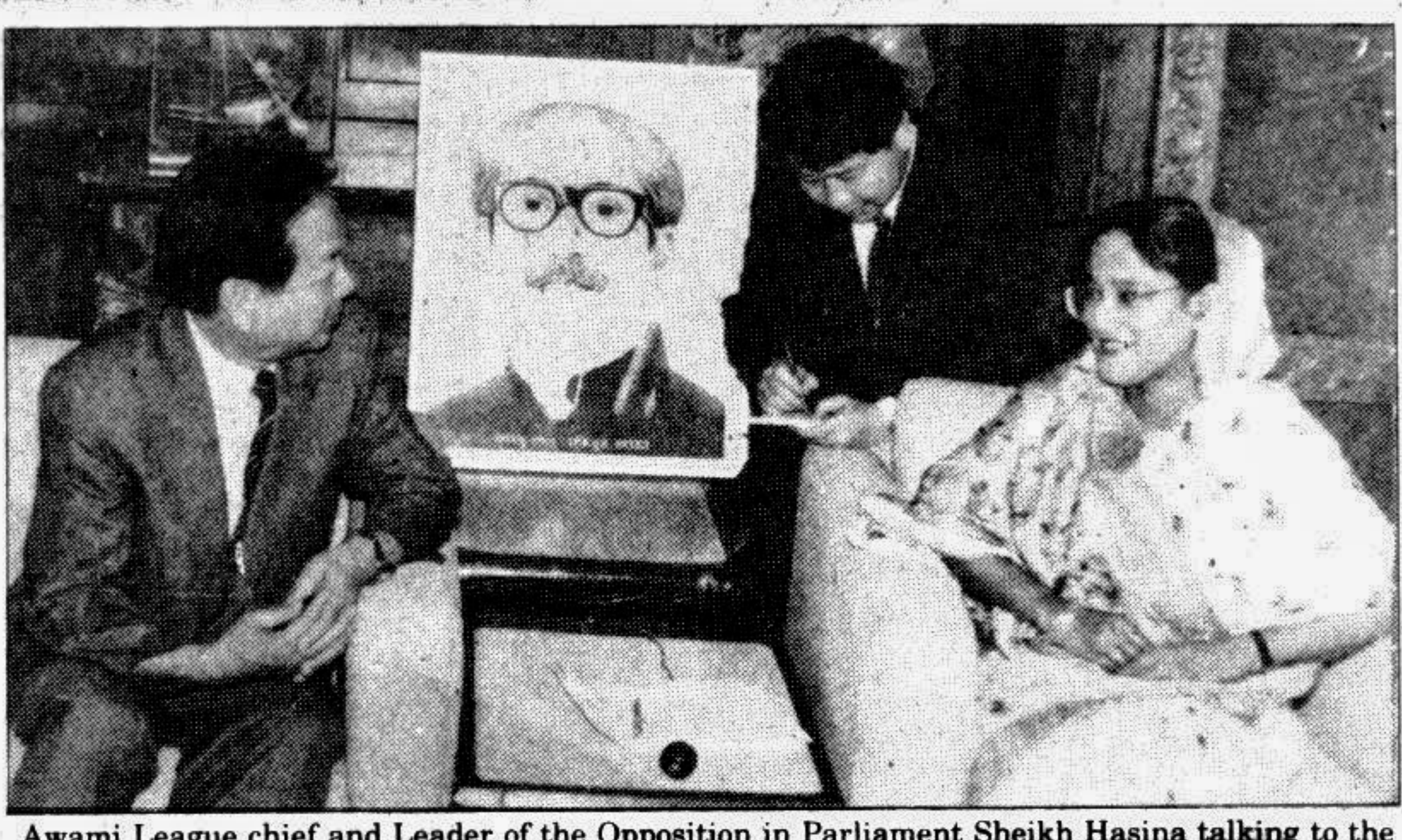
Awami League chief and Leader of the Opposition in Parliament Sheikh Hasina talking to the visiting Chinese Vice Premier and Foreign Minister Qian Qichen, when he called on her at the Sangsad Bhavan yesterday.