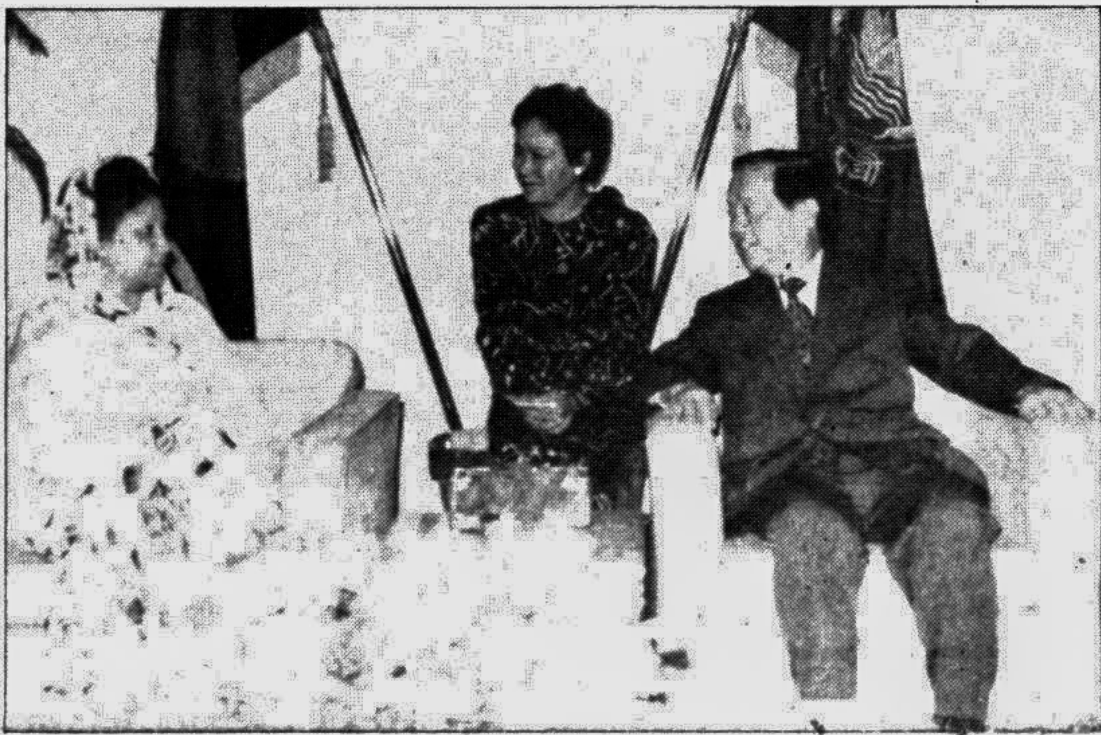
The visiting Chinese Vice Premier and Foreign Minister Qian Qichen called on Prime Minister Begum Khaleda Zia at her office yesterday.