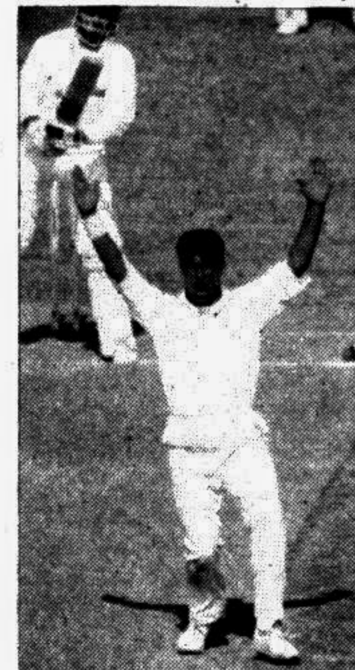
WAQAR... 6 for 78

Akram quickly disposed of Mark Greatbatch leg before for one. Younis had Shane Thomson caught behind by