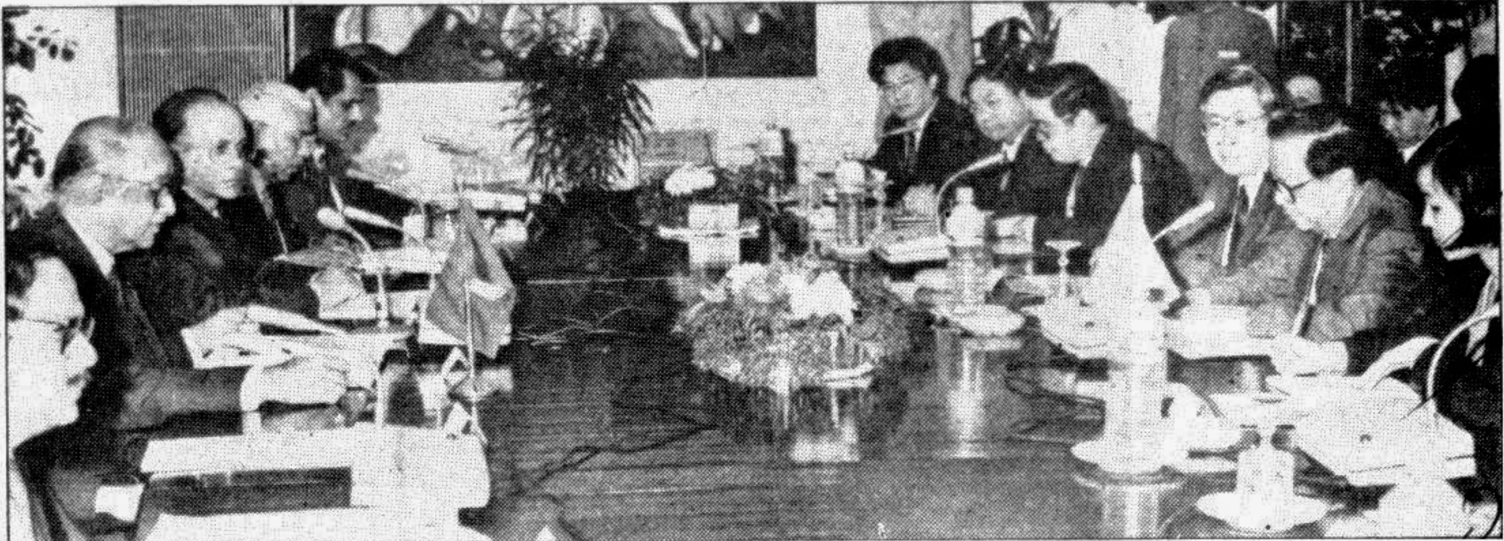
Chinese Vice Premier and Foreign Minister Qian Qichen and Bangladesh Foreign Minister A S M Mostafizur Rahman led their respective sides at the official talks held at the State Guest House Meghna in the city yesterday.

The Awami League is engaged in the politics of expediency rather than the politics of ideology and principle the ruling party Secretary-General and LGRD Minister Abdus Salam Talukder said yesterday reacting to the latest opposition agreement in Parliament. 'Yesterday's meeting of the opposition parties prove they can do anything for power.' See Page 12 Col 1