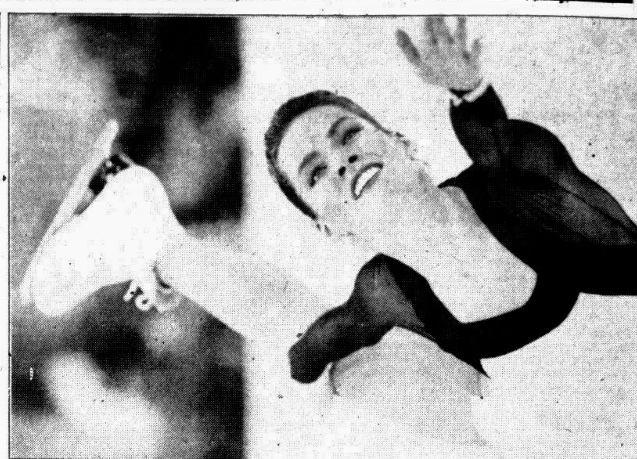
Nancy Kerrigan of USA in action during the figure skating technical programme in the XVII Winter Olympic Games in Hamar on Feb 23.