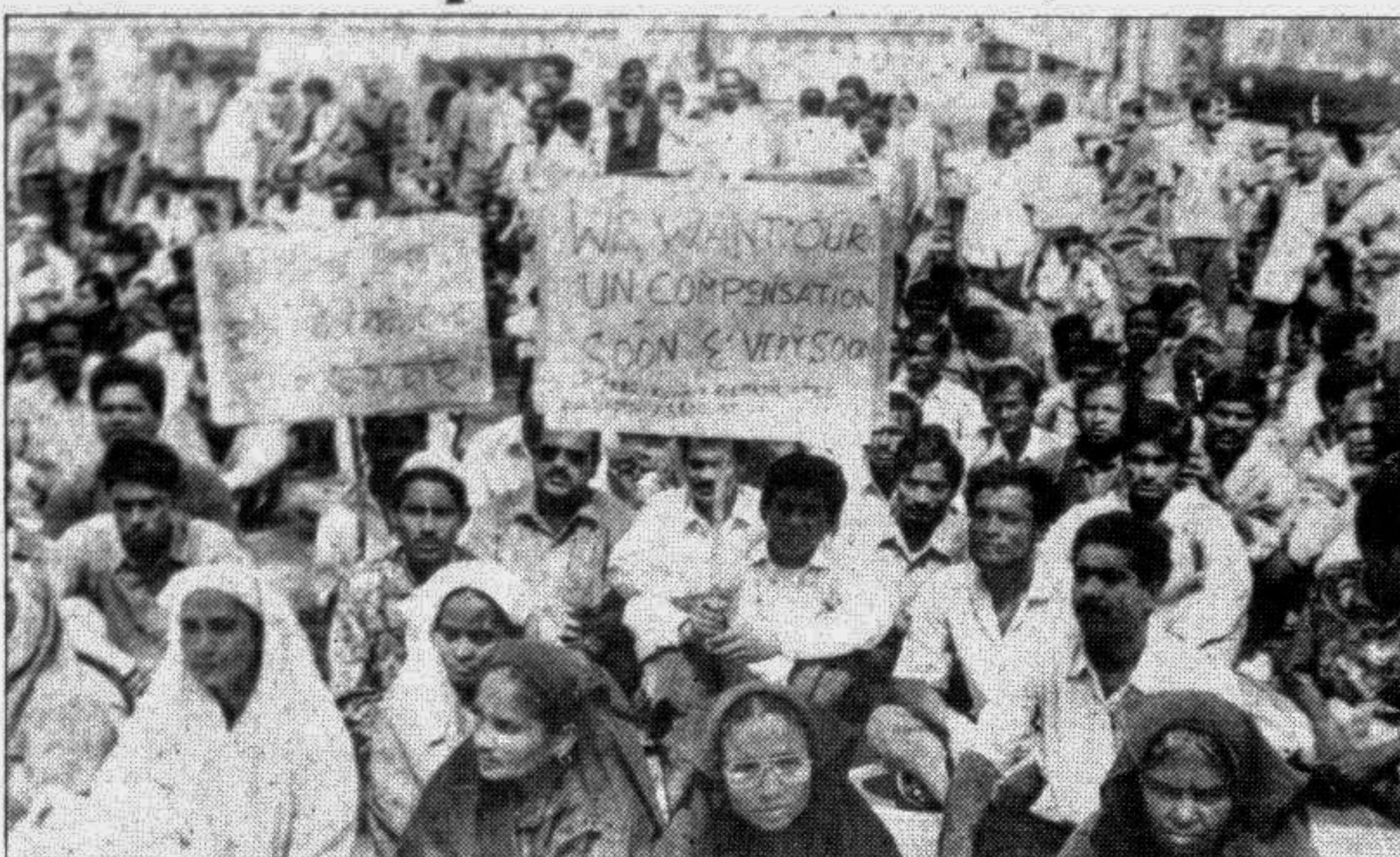
Returnees from Kuwait and Iraq held a rally demanding immediate payment of compensation money in front of the Jatiya Press Club yesterday.

For a band formed only a year ago, Quicksand is a band with enough enthusiasm and depth to appeal to young people. The name 'Quicksand' was given to symbolize something that appears innocuous yet once you step into it you are pulled deep inside never to come out. With its provocative lyrics and seriousness this band intends to bring everyone into its musical trap.