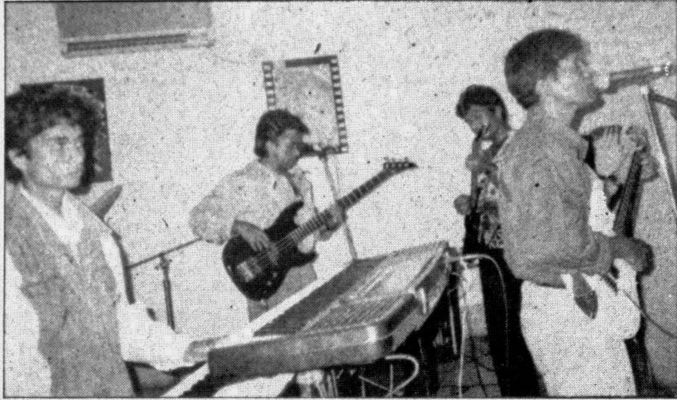
Quicksand members give a good account of themselves.

The audience awaited with mixed feelings. It was past 9 o'clock and the seats were only half-full at the Cafe at Alliance Francaise, the venue of the show. The somewhat tepid enthusiasm could perhaps be attributed to the fact that nobody really knew anything about 'Quicksand' the band that was to perform that night. After all, hadn't we seen enough of half-baked, mediocre rock groups whose names one forgot as easily as their poor music? The audience have become weary of singers with no voice or sense of tune and of bands that had far too many instruments than they knew what to do with. They were waiting for something new.