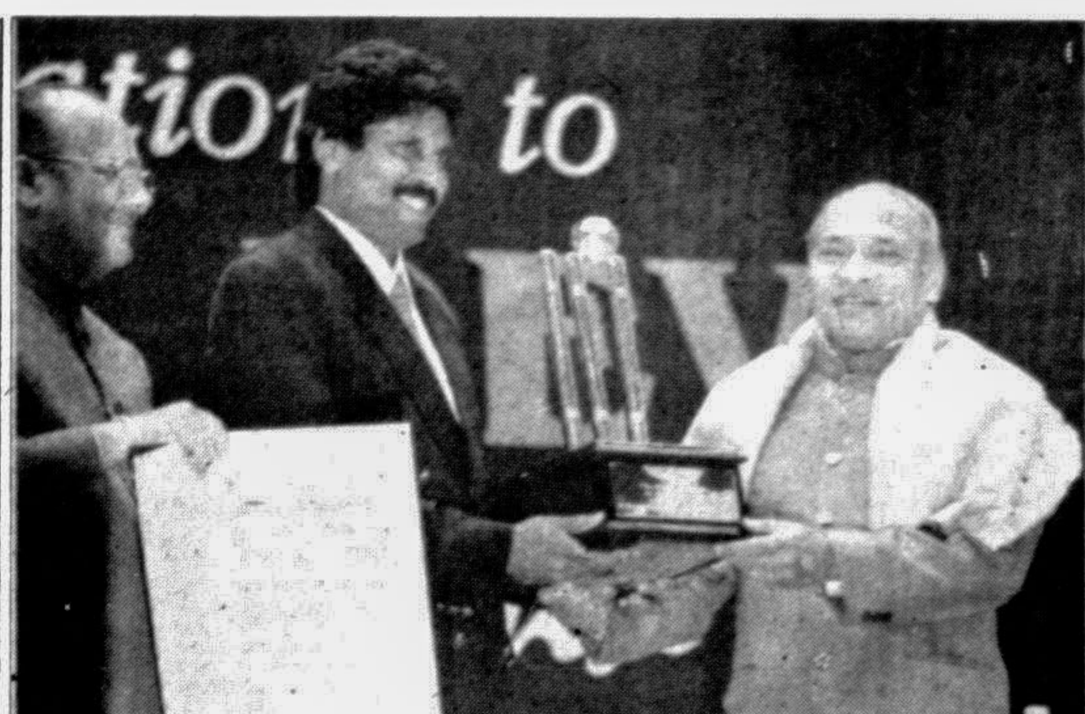
Indian Prime Minister P V Narasimha Rao (R) presents a trophy to Kapil Dev, who earlier this month became Test cricket's highest wicket-taker, at a simple ceremony in New Delhi on Feb 21.

BANGKOK, Feb 22: Thailand B outlasted Germany's West Faten 4-0 after a goalless first-half to emerge as champions in the 5th King's Cup football tournament here Monday, reports AFP.