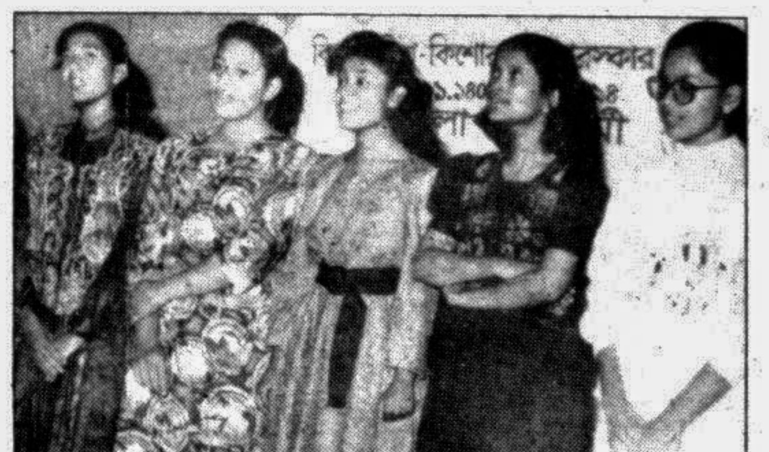
Music competition at Bangla Academy.