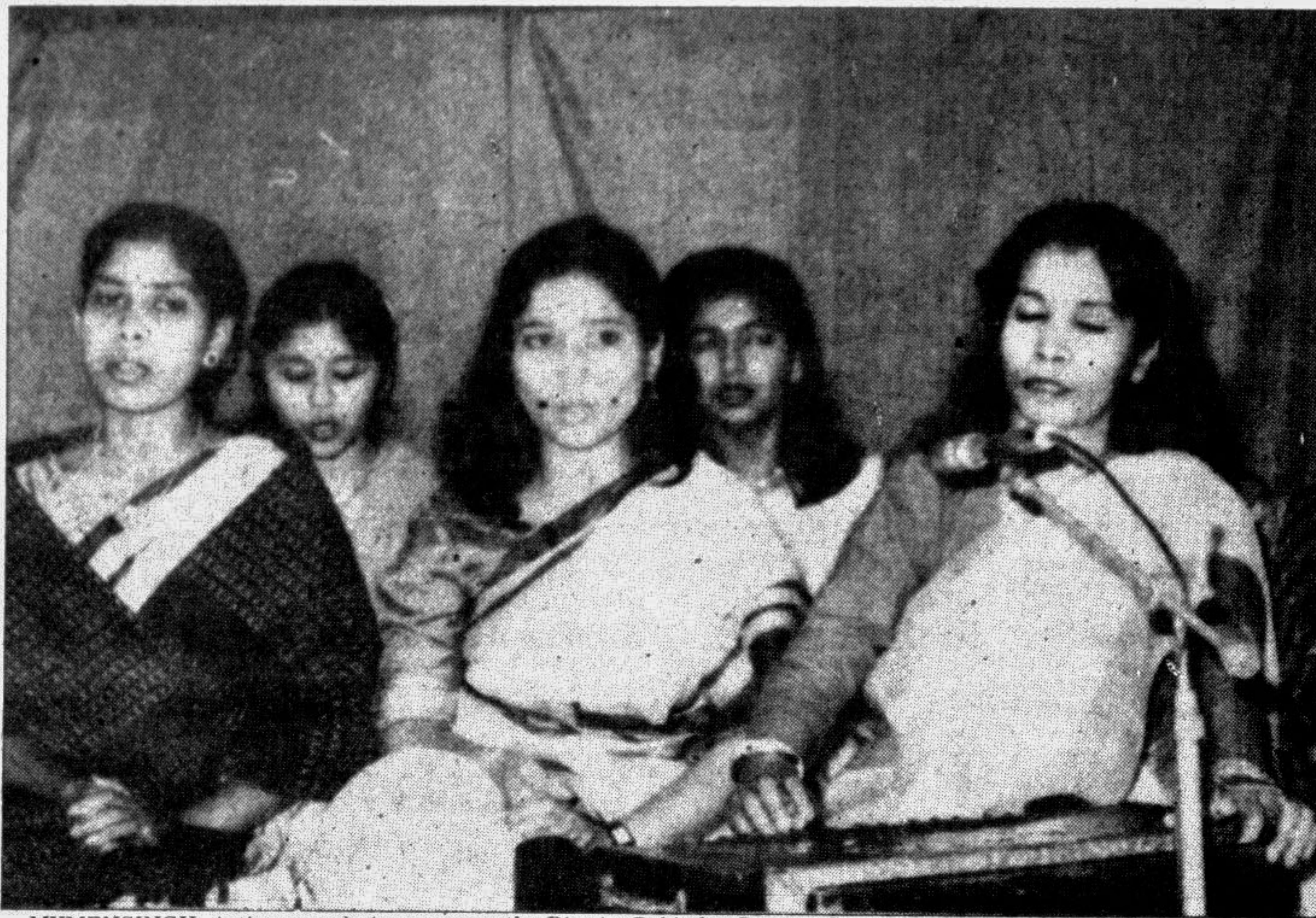
MYMENSINGH: Artistes rendering songs at the District Rabindra Sangeet Sammelan held recently at the local Muslim Institute.

Deputy Commissioner and SP of the district visited the spot.