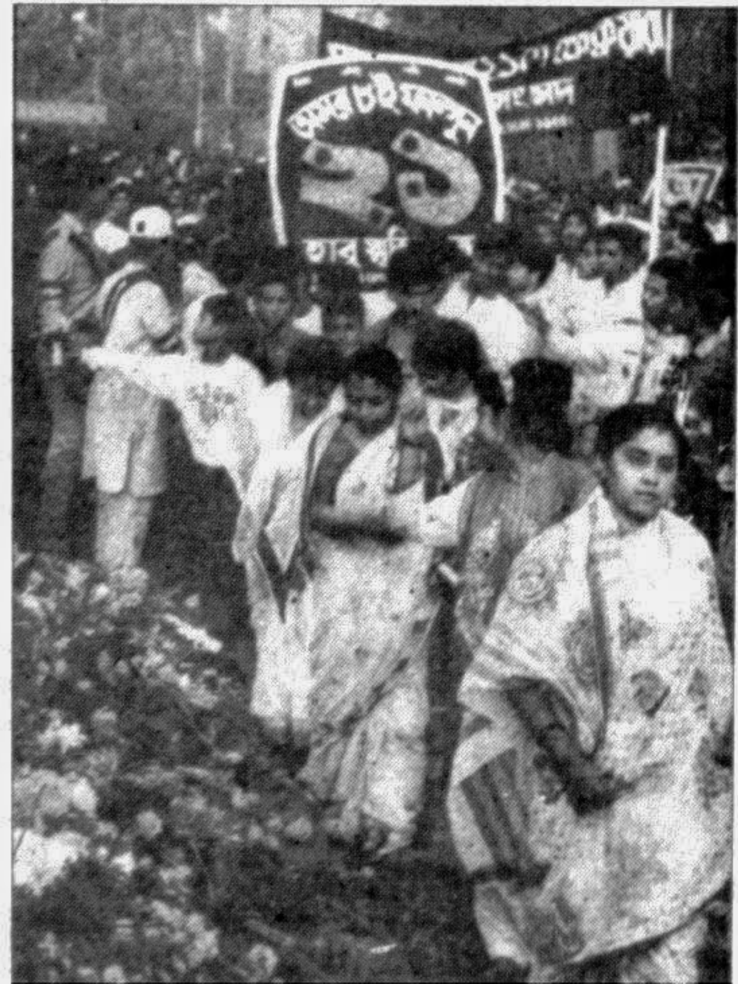
Members of the public