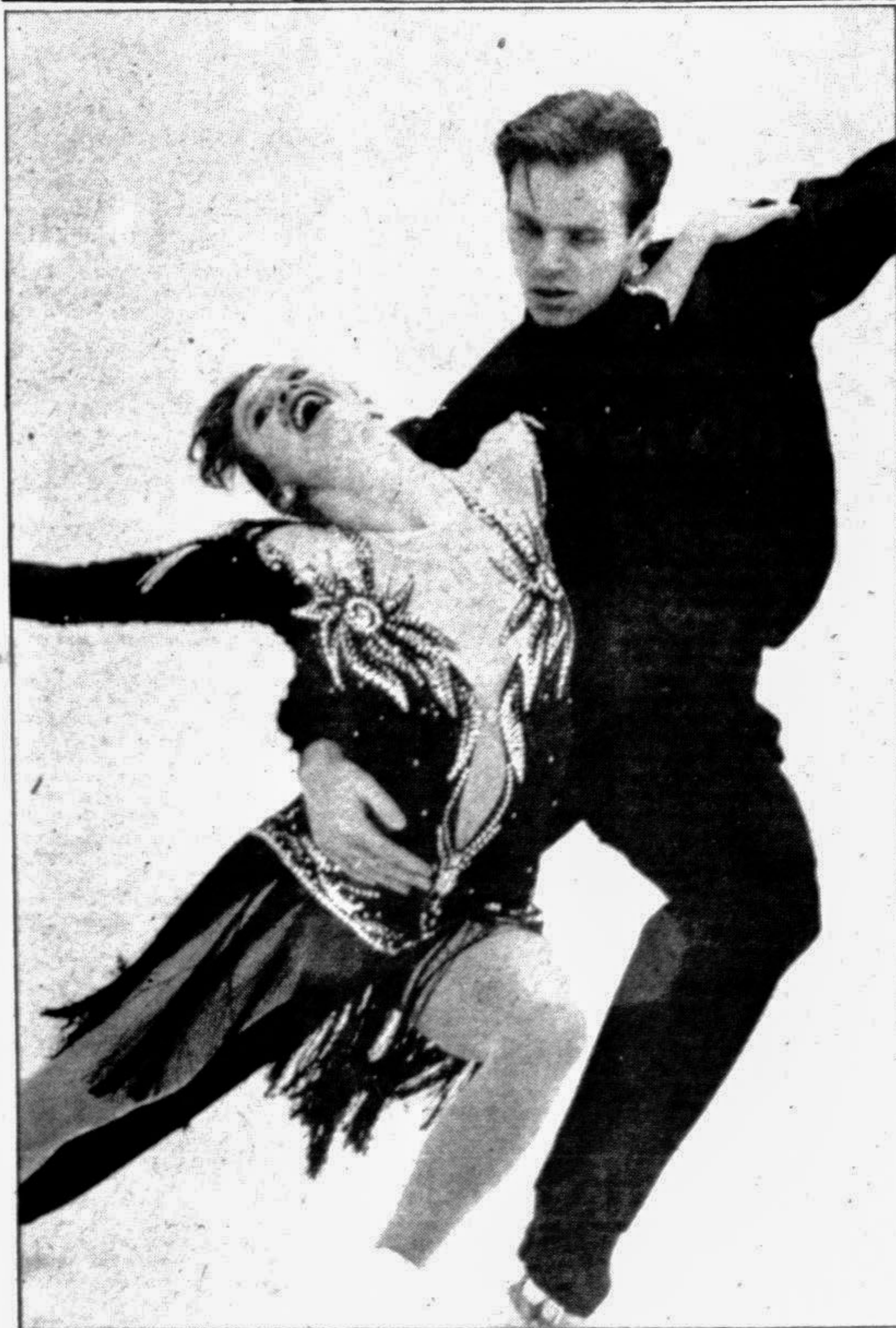
Russia's Yevgeny Platov and his partner Oksana Griachtchuck perform the second part of their compulsory dance routine in the Hamar Olympic Amphitheatre on Feb 18.

The Iranian arrived in Norway on a ferry from Kiel in Germany on Friday and told customs officials who found the drugs during a spot check that he had intended driving to the Olympics.