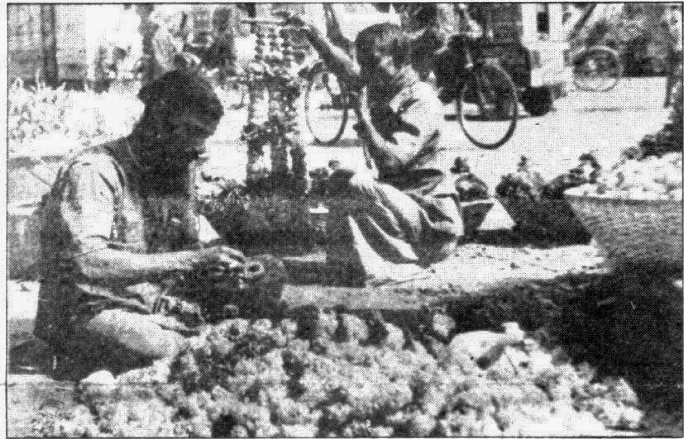
Florists seen working double time yesterday to prepare as many wreaths and bouquets for sale on the Amar Ekushey tomorrow in the city.