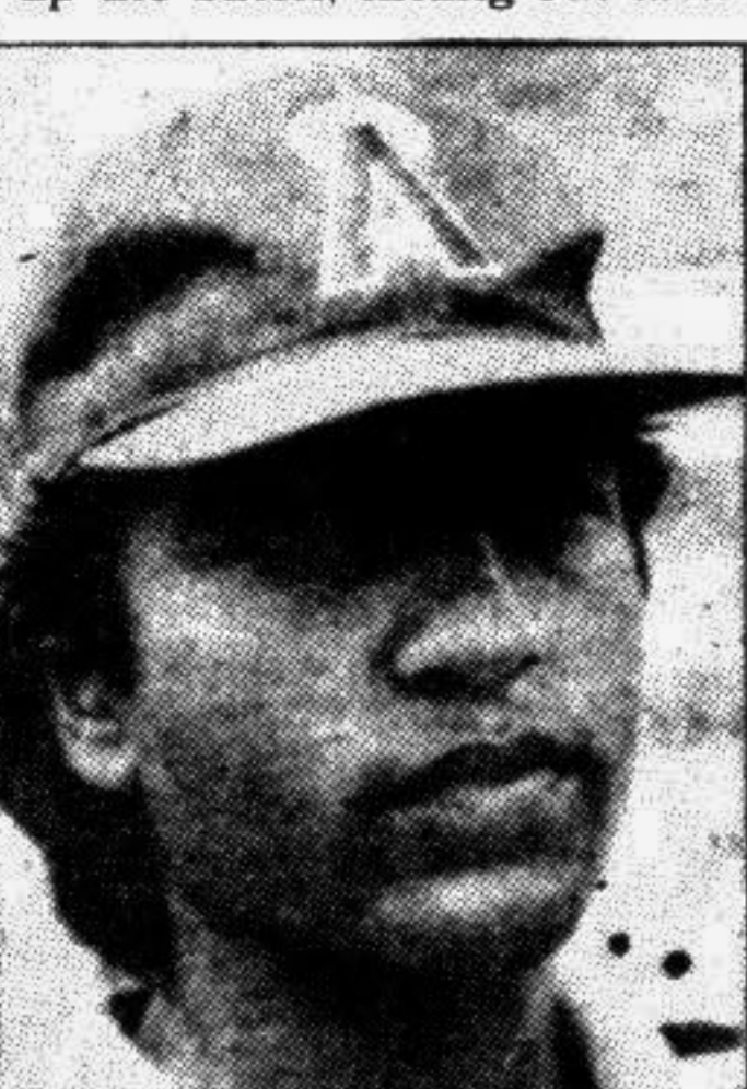
ANWAR ... 169

He scored 13 fours in his 209-minute innings. Malik and Inzamam picked up the baton, hitting out after