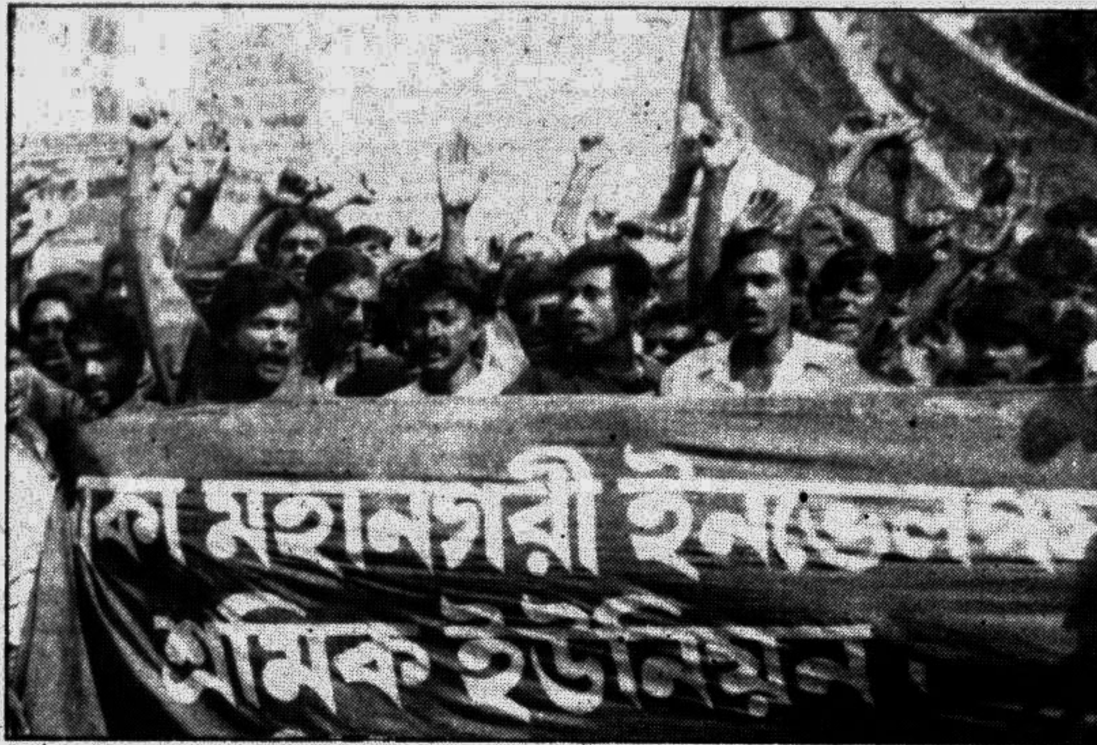
The Dhaka City Envelopes Labour Union brought out a procession in the city yesterday.