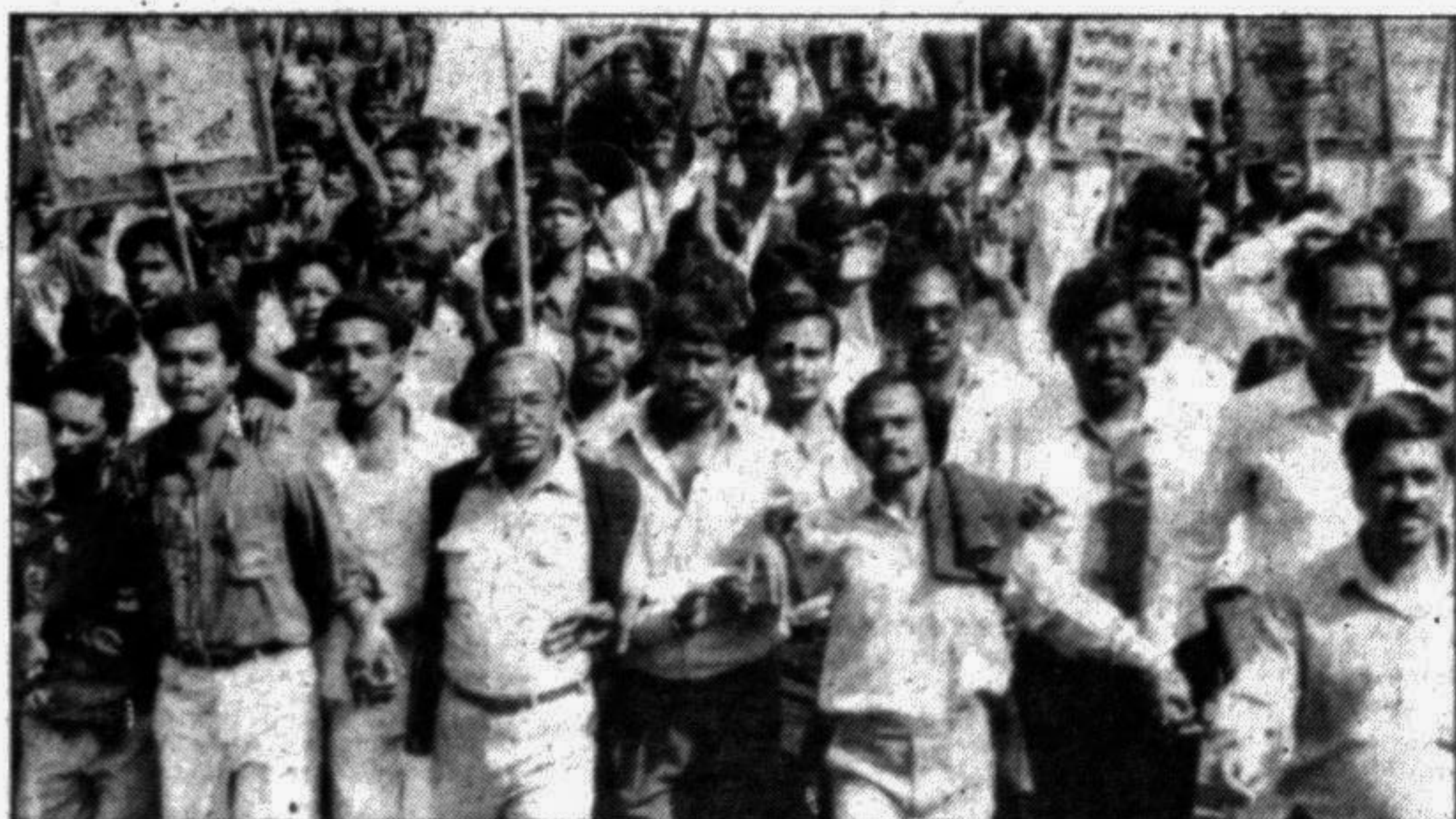
The Book Binding Owners' Association staged a procession demanding a ban on import of Bengali books printed abroad in the city yesterday.

BSB BUILDING, 8 RAJUK AVENUE DHAKA-1000, BANGLADESH Phone: PABX - 240105-6, 235080 Telex: 671186 RIL BJ