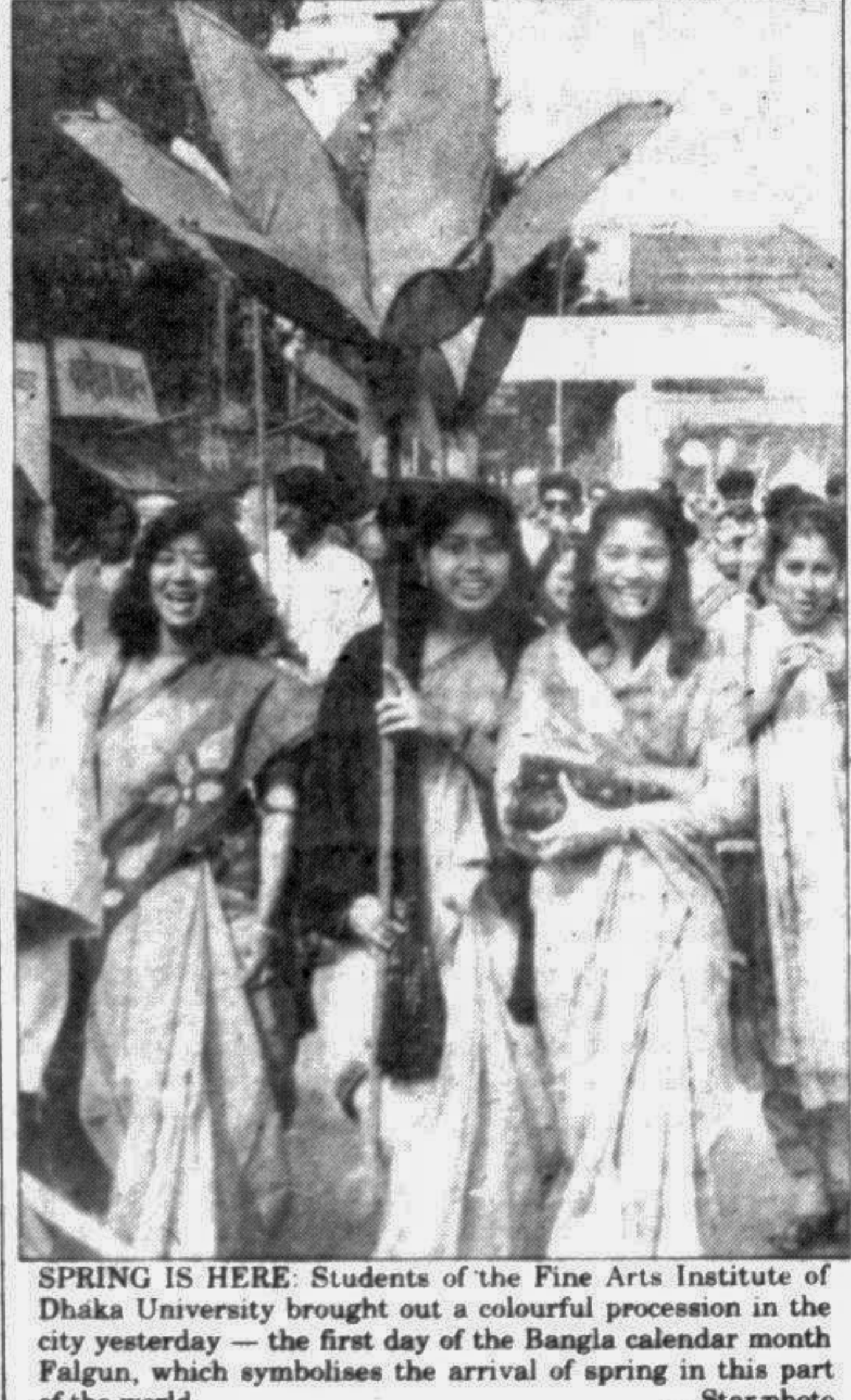
SPRING IS HERE: Students of the Fine Arts Institute of Dhaka University brought out a colourful procession in the city yesterday — the first day of the Bangla calendar month Falgun, which symbolises the arrival of spring in this part of the world.