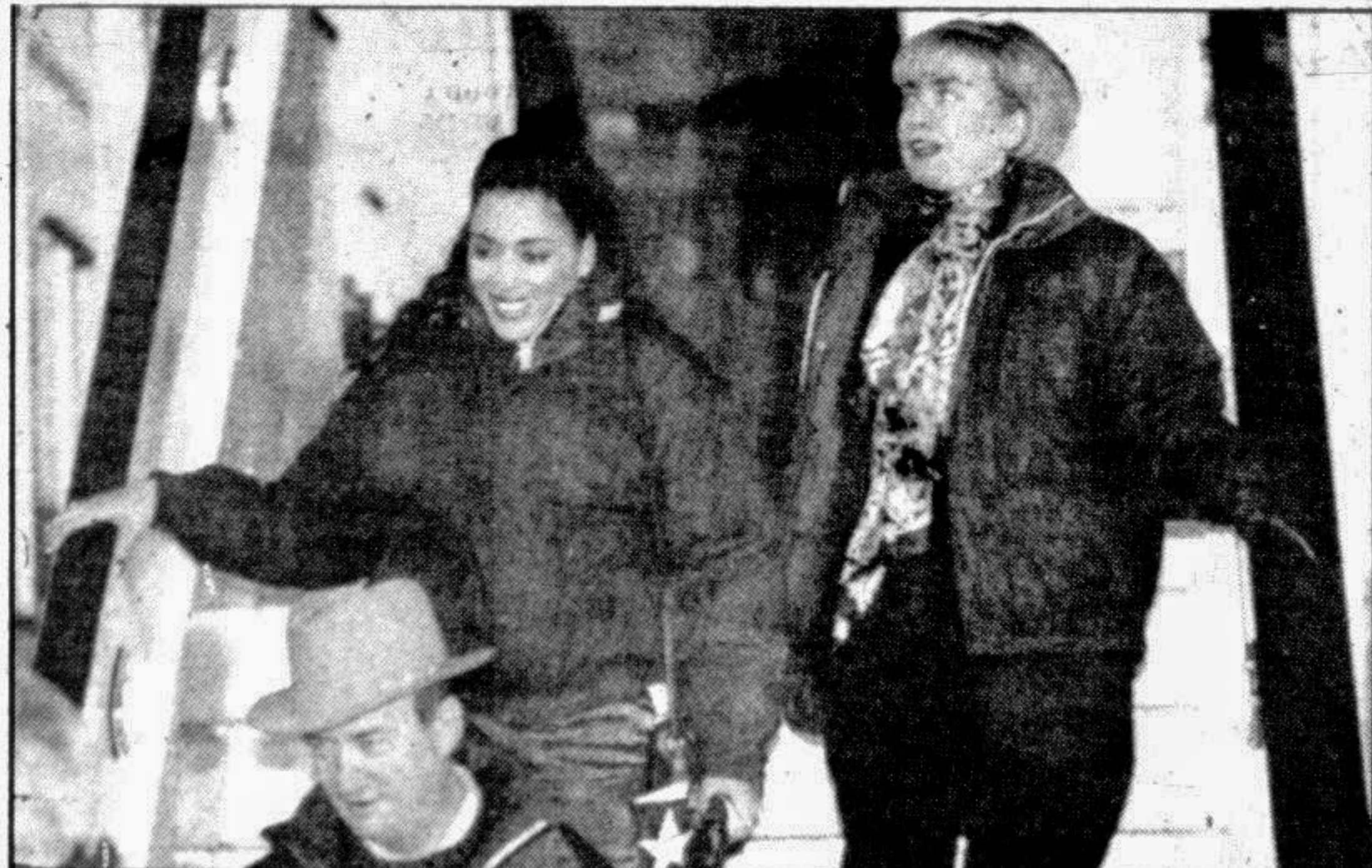
US first lady Hillary Clinton (R) is accompanied by former Olympic gold medalist Florence Griffith-Joyner as they arrived in Norway on Feb 11 representing the US delegation at the XVII Winter Olympic Games.