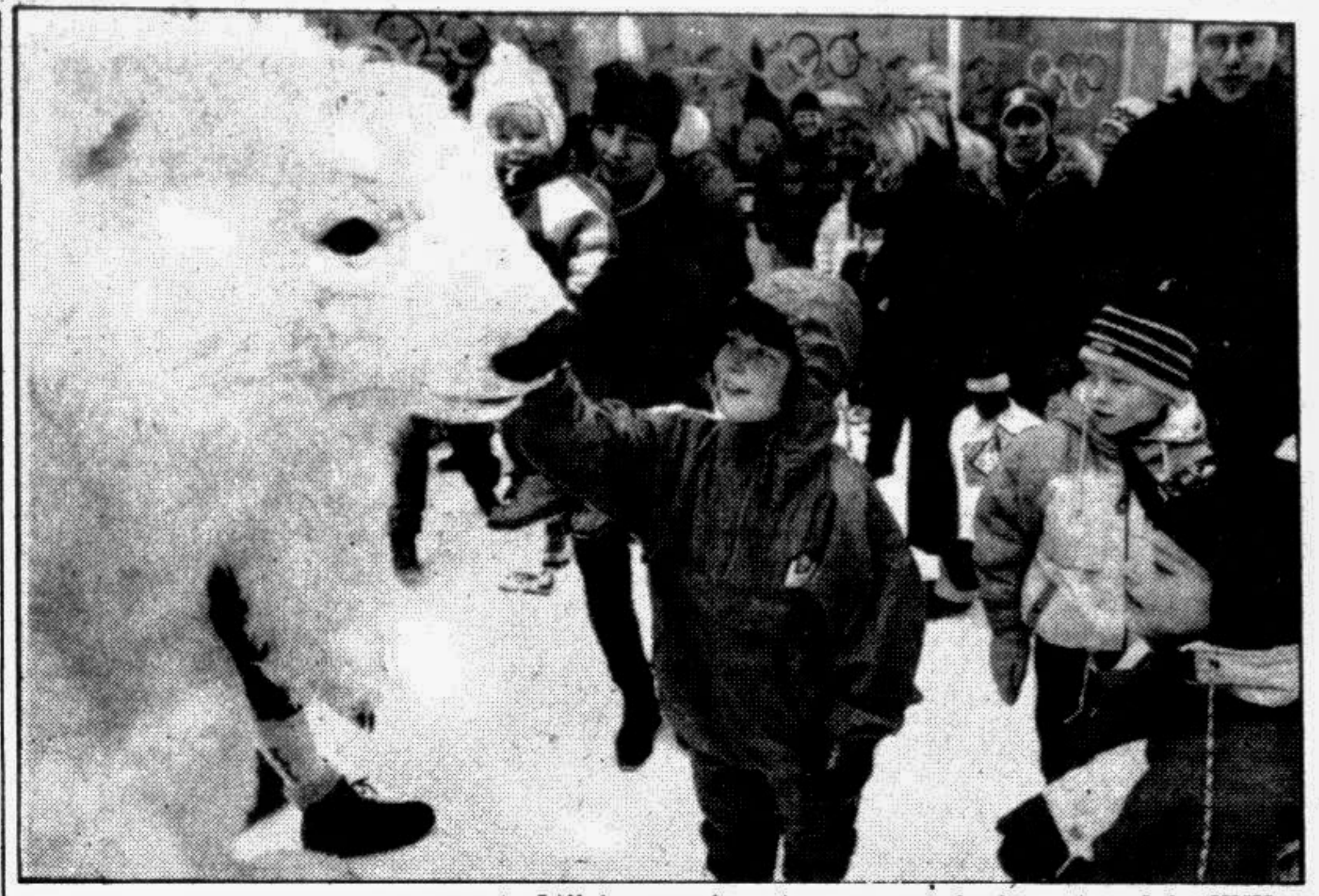
Kids play with a mock polar bear in Lillehammer's main street as the host city of the XVII Winter Olympic Games prepares for the opening ceremony today.