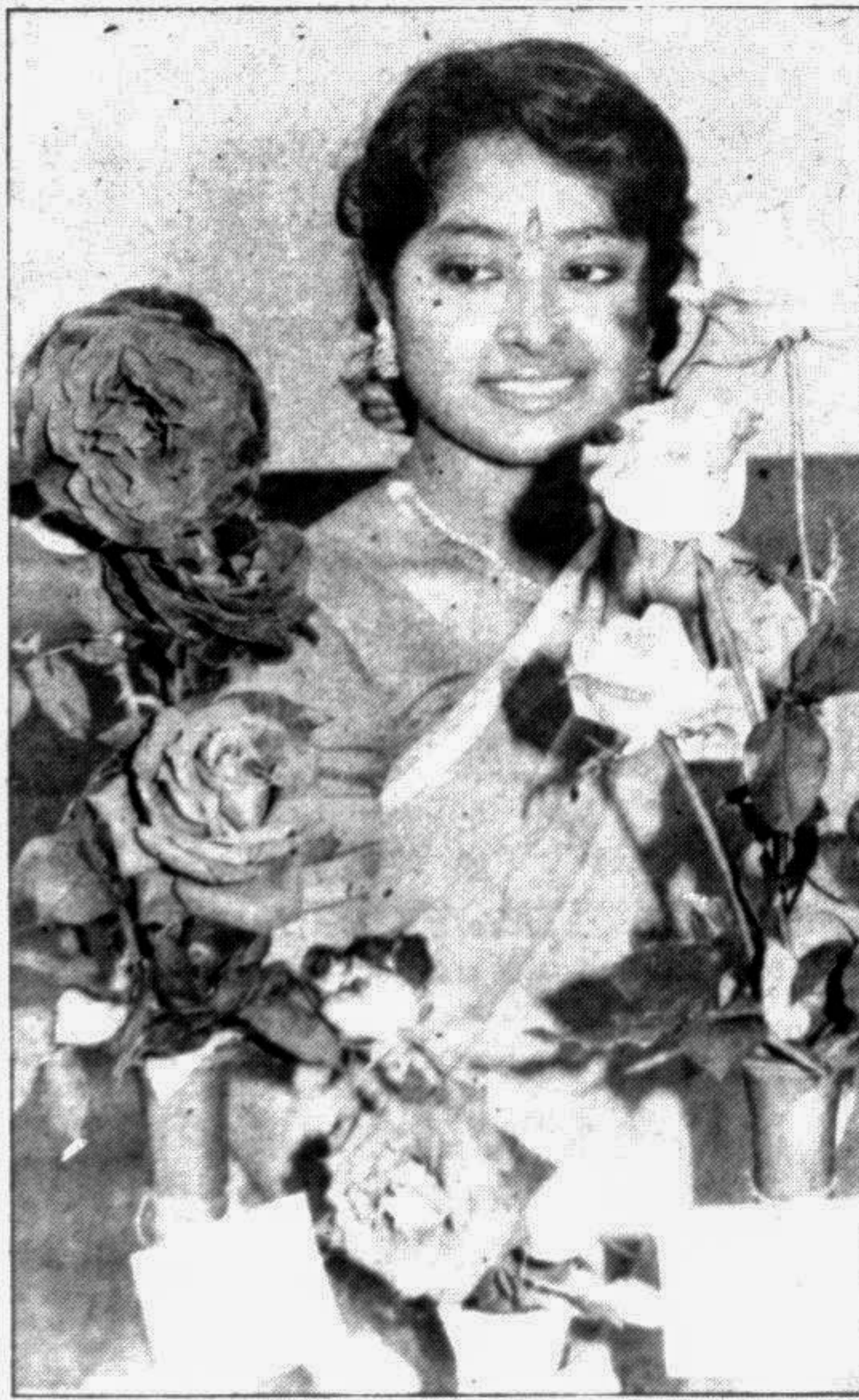
The National Rose Society arranged its annual Rose Festival '94 at the Dhanmondi Women's Sports Complex in the city yesterday.

GHORASAL, Feb 11: Heads of 23 foreign missions based in Dhaka today visited the Ghorasal Power Station Complex to have a first hand knowledge of the power generation system in Bangladesh, reports UNB. The visit took place at a time when the entire country, including capital Dhaka, has been put under staggered loadshedding for last two weeks due to insufficient power generation. The diplomats visited the thermal power station at Ghorasal, about 60 kilometres north-east of the capital, on their way to Sreemangal at the invitation of the Foreign Ministry. Foreign Minister A S M Mostafizur Rahman, Finance Minister M Saifur Rahman, Foreign Secretary Muefleh R Osmany and Commerce Secretary A H Mofazzal Karim accompanied the diplomats. PDB Chairman Kazi Golam Rahman received the distinguished visitors at the complex, the second largest of the country having 530 megawatt installed capacity in its four units. The capacity will rise to 950 MW by 1996 when two more 210 MW units will be added to the complex.