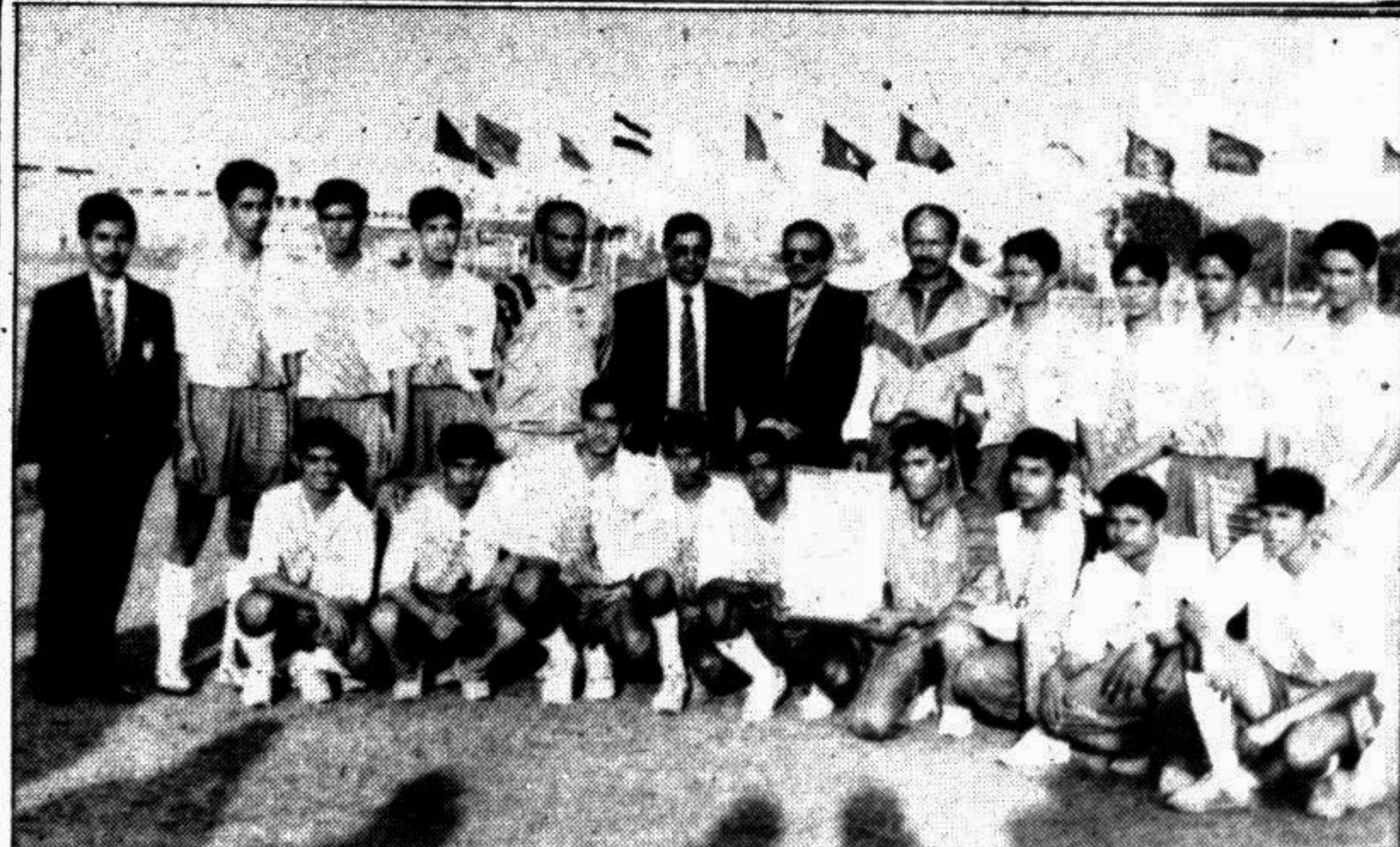
The newly crowned national youth hockey champions BKSP who beat Dhaka DSA 3-1 in the final at the BKSP ground at Savar yesterday.