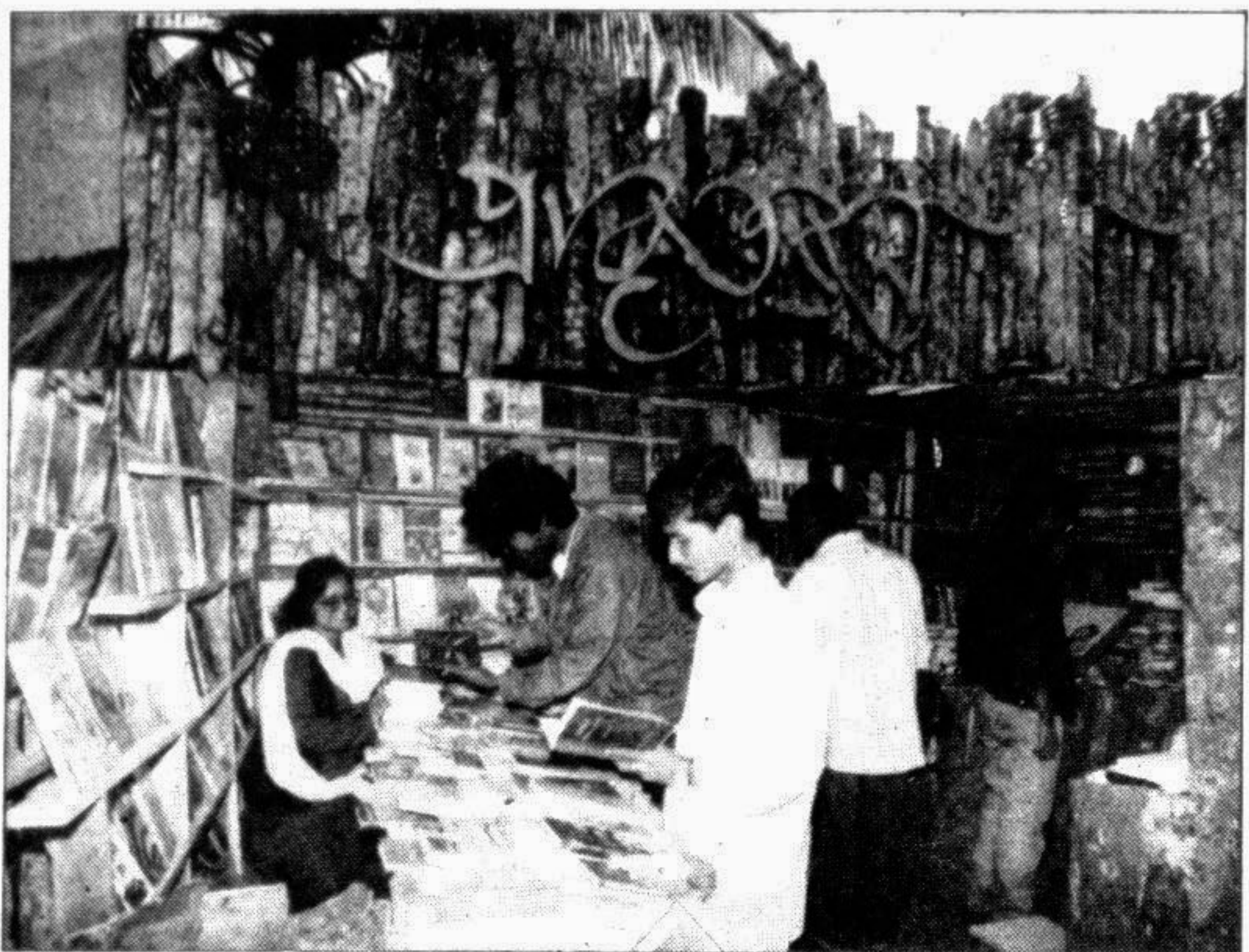
Interior of a book-stall with exceptional decoration.

As traditions go, the annual Ekushey Boi Mela at the Bangla Academy premise is one that never fails to create a wave of excitement among us. After all, how many times do we get a chance to browse among a sea of books written by our favourite and not-so-favourite authors? Certainly not often in this city where there is a great dearth of good libraries. For book lovers, therefore, the 'boi mela' is something close to paradise.