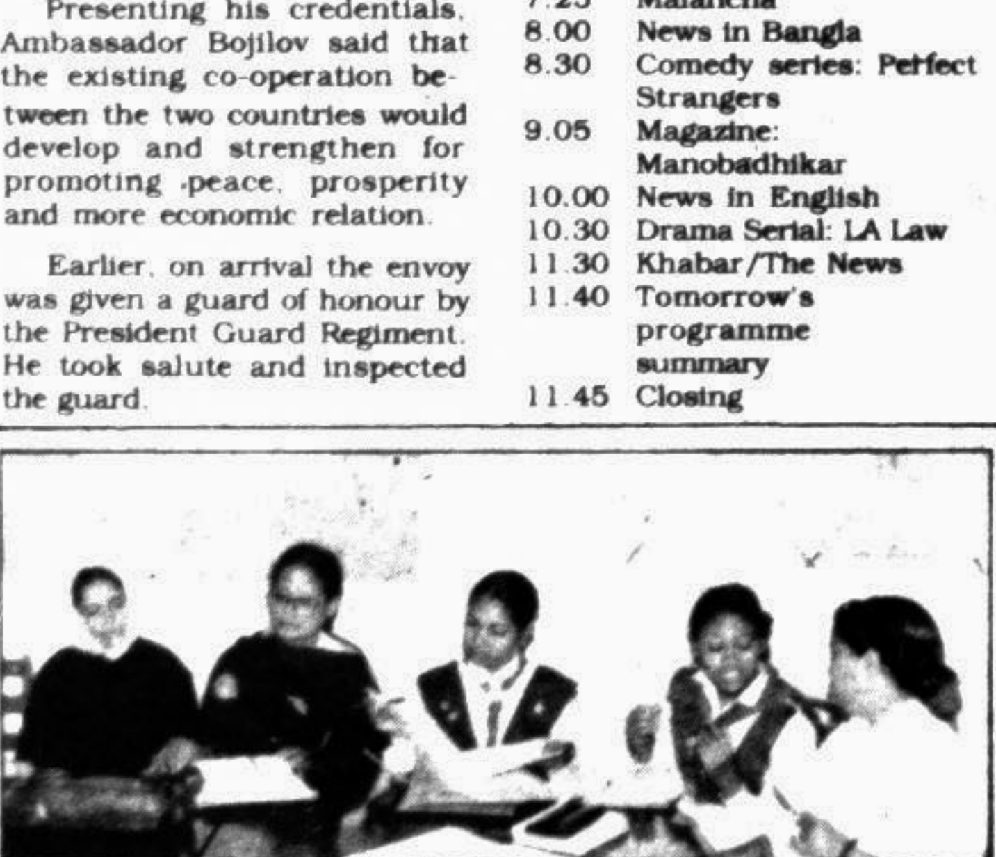
A two-day ranger council of the Bangladesh Girl Guides was inaugurated at its national headquarters in the city yesterday.

Earlier, on arrival the envoy was given a guard of honour by the President Guard Regiment. He took salute and inspected the guard.