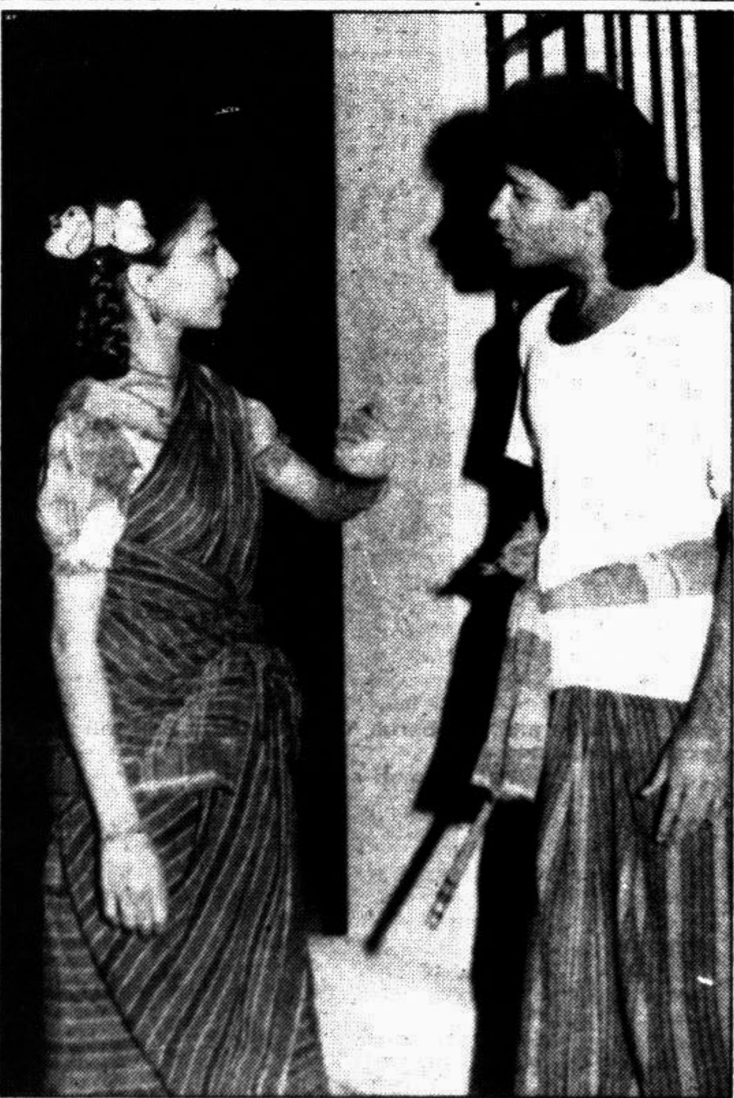
A sequence of drama 'Bahaman' staged at the Central Shaheed Minar by Bangladesh Theatre yesterday in observance of Amar Ekushey.

The Prime Minister expressed her confidence that the existing bonds of friendship and cooperation between the two countries would be further strengthened.