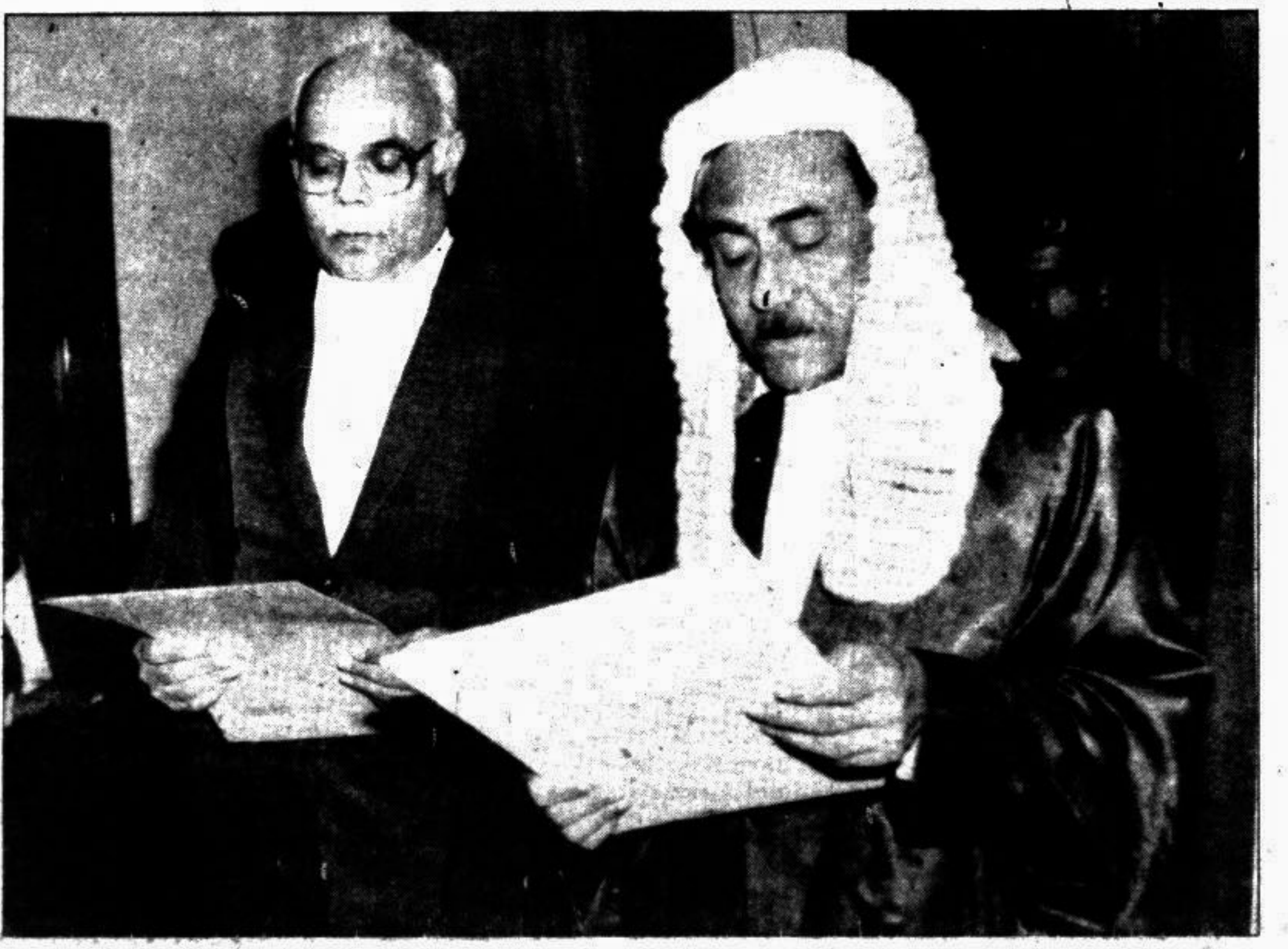
Chief Justice Shahabuddin Ahmed administering the oath of office to a newly appointed Additional Judge of the High Court at his Supreme Court chamber yesterday.