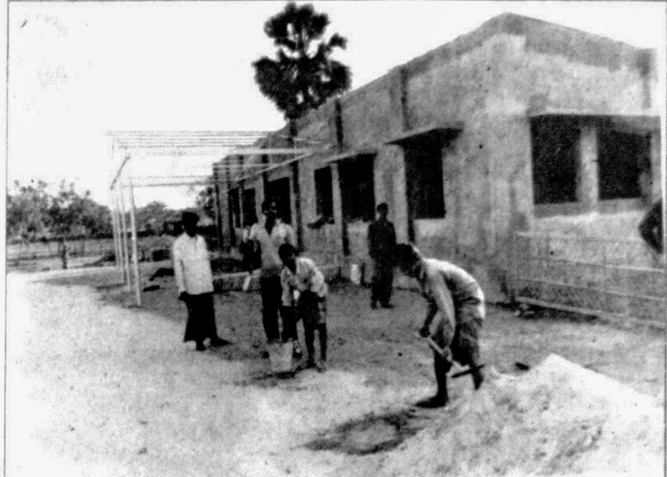
A terminal building is being constructed at the city's old Tejgaon Airport for the STOL service on domestic routes. The picture was taken yesterday.

party was yet to be born at the time," Moudud retorted. Mohammad Nasim, Opposition Chief Whip, echoing Moudud's views, told the House that his party was now ready to restore the original Constitution (1972) of the country for ensuring an independent judiciary. Salauddin Kader Chowdhury of the NDP, referring to newspaper reports that the lawyers had asked the Chief Justice not to administer oaths to the newly-appointed judges, said the nation wanted "rule of law, not the rule of lawyers." Earlier, Information Minister Barrister Nazmul Huda and Education Minister Barrister Jamiruddin Sircar, while replying to the Opposition criticism that the BNP had appointed their own men as judges, said it was not important who had been appointed. "What is important in this regard is whether the persons fulfil the qualifications, laid down in the Constitution, to be judges," the ministers argued. Others who took part in the deliberations included Rashed Khan Menon, Suranjit Gengupta, Shahjahan Siraj, Sheikh Anser Ali, Sheikh Fazlul Karim Selim and Shudhangshu Shekhar Halder. After the long discussion was over, the Speaker told the House that he needed the opinion of the JS Business Advisory Committee to decide whether a discussion on the matter was necessary. The advisory committee meeting is scheduled for Friday. However, the Chair adjourned the sitting, before taking up yesterday's order of the day, at 9 pm to resume again at 4:30 this afternoon.