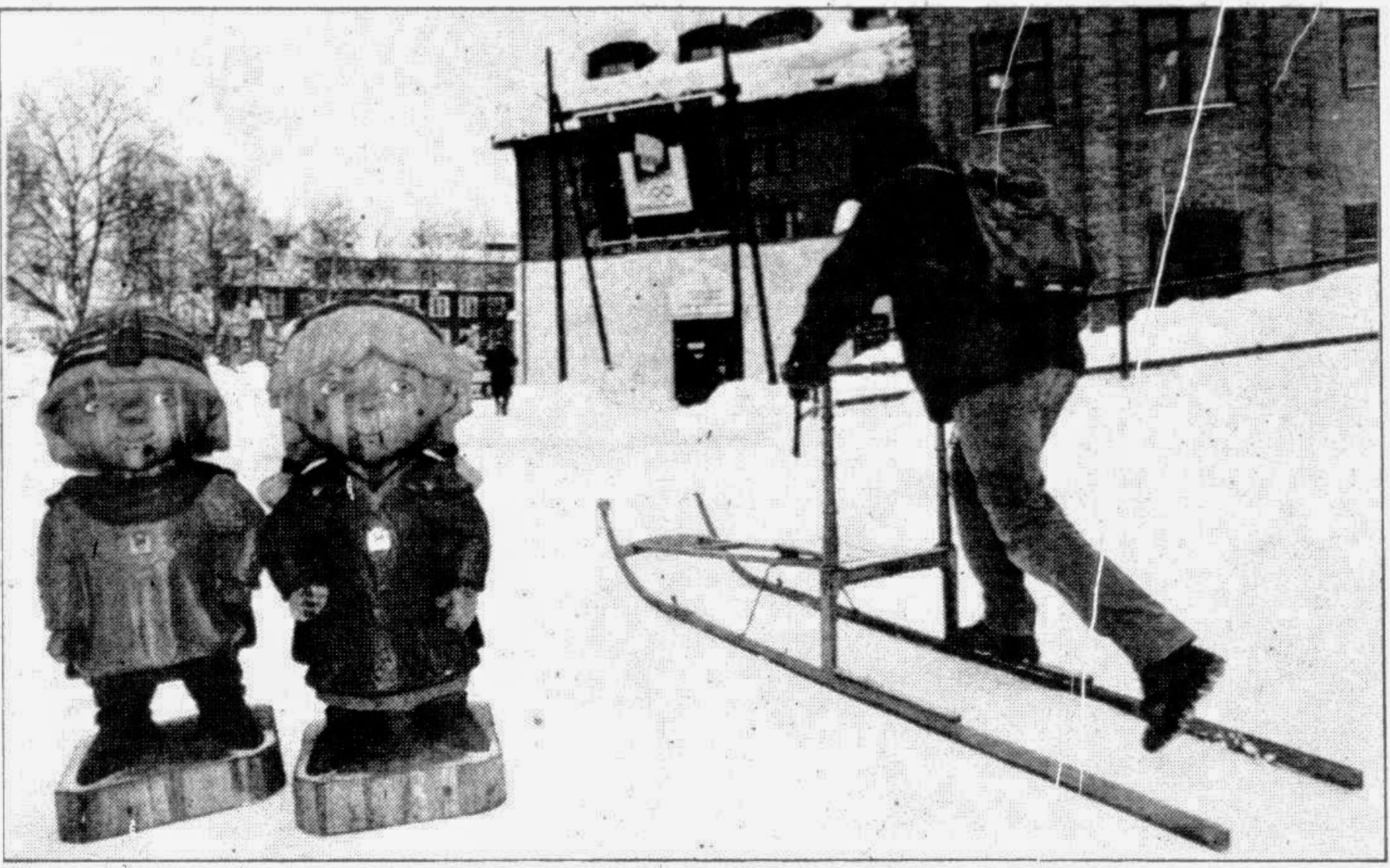
A resident of Lillehammer slides past the mascots Kristin and Hakon of the XVII Winter Olympic Games yesterday. The Games begin on Feb 12.