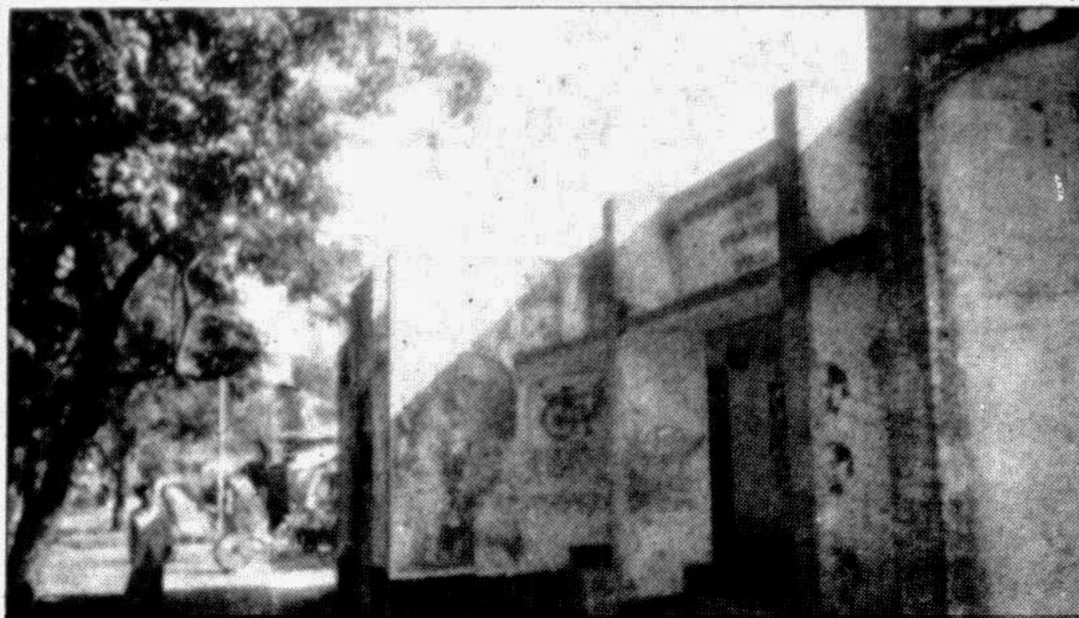
MADARIPUR: The only diabetic clinic in the district, Hazera Howladar Diabetic Clinic, was closed down after few days of operation.

The arms and ammunition included one 303 rifle, one Belgium made gun, three cut guns, one cut rifle and 24 rounds of ammunition. Police said the arrested people had a link with a number of dacoities committed in the thana recently. Two separate cases were filed.