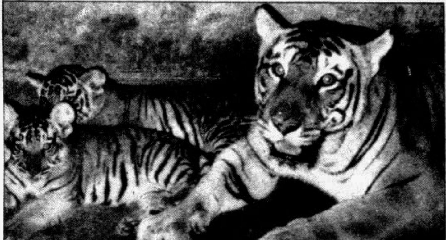
This tigress, brought from the Sundarban forest, is seen with her newly born cubs at Mirpur Zoo.

Royal Bengal Tigers, the national wealth of Bangladesh needs better preservation facilities to attract larger masses of foreign as well as local tourists.