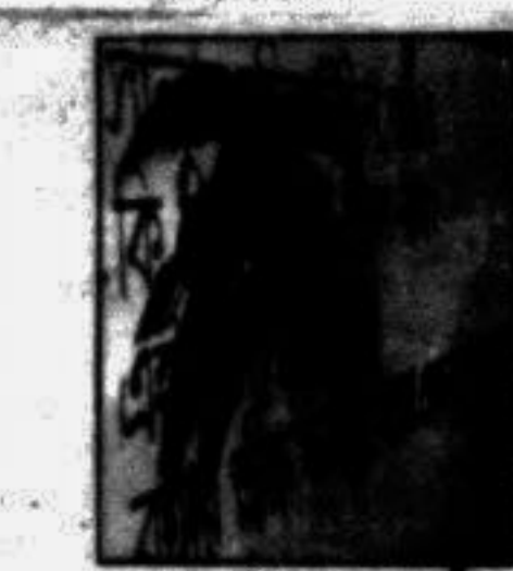
Sacrilege of Ekushey Page 3