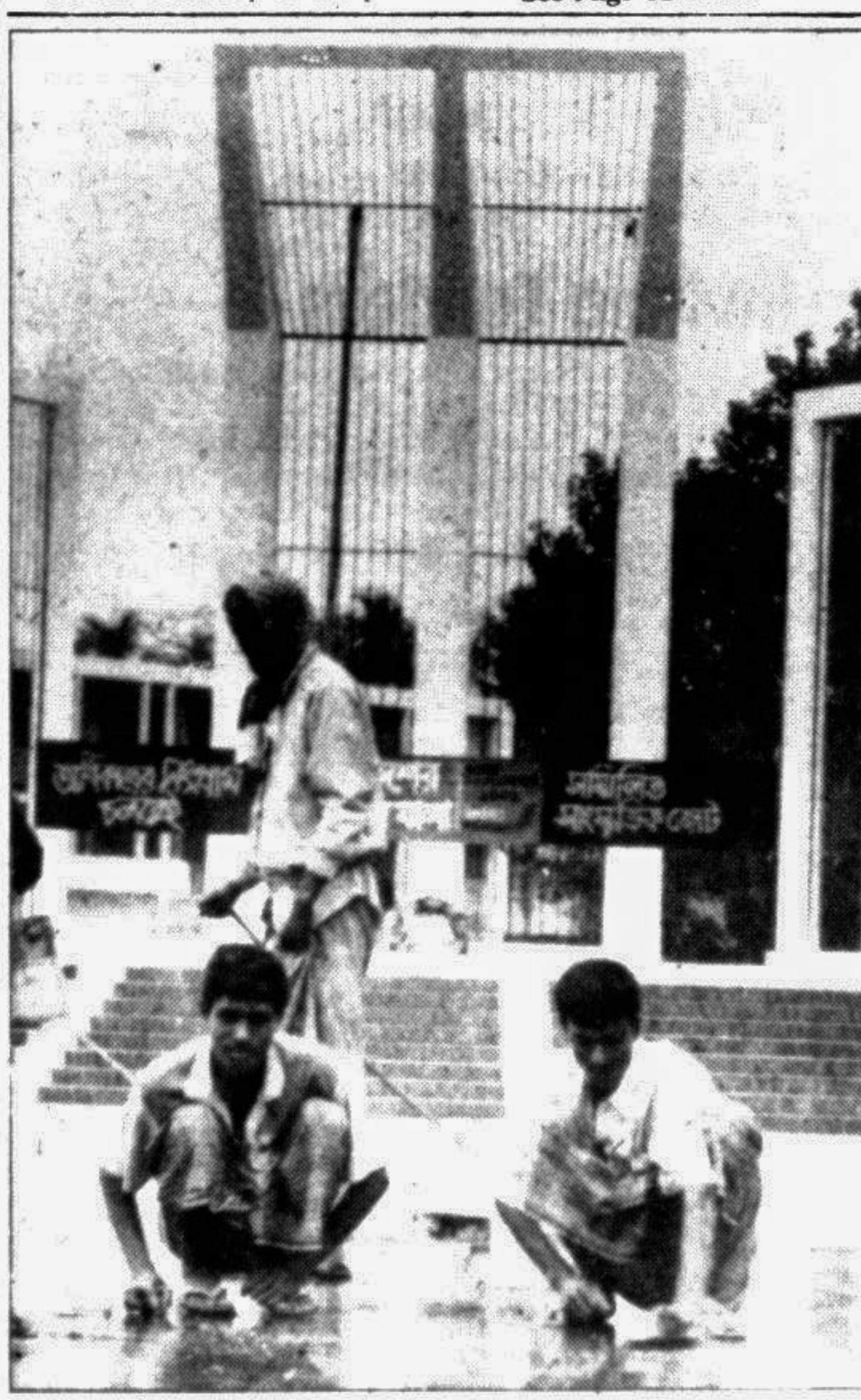
The Central Shaheed Minar in the city is being given a face-lift before The Shaheed Day on February 21.

In order to improve relations and bring it to a mutually beneficial level Gujral suggested that India and Bangladesh should review the entire gamut of bilateral relations and examine sufficiently