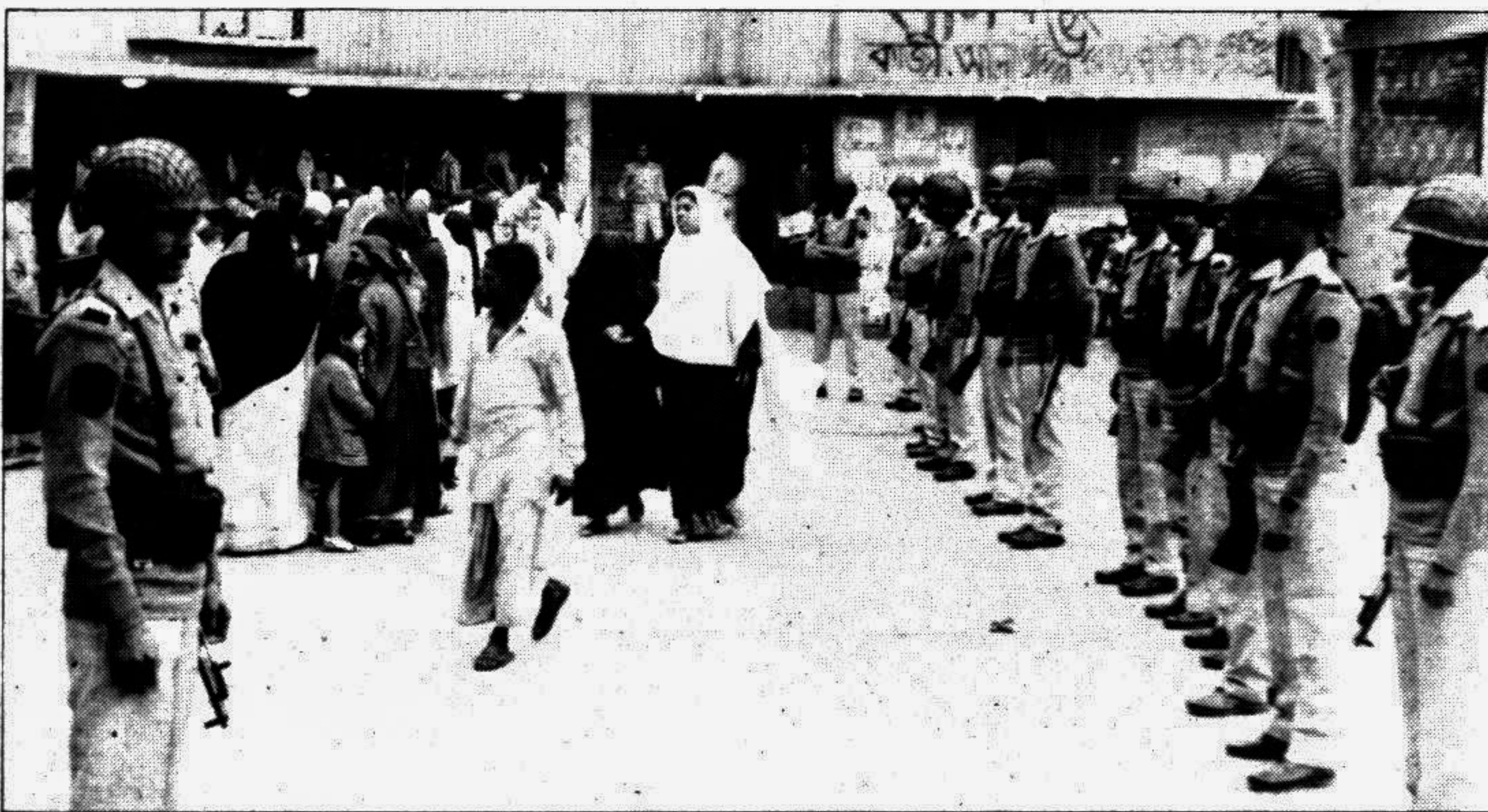
BDR personnel keep vigil as voting progresses peacefully during the re-polling at the Siddiq Bazar Community Centre in the city yesterday.