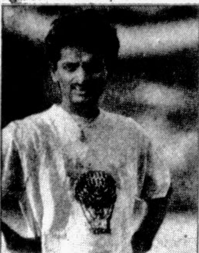
RAJU... 5 for 38

Number 10 Pramodaya Wickramasinghe hit two boundaries and a six in a top score of 22 as six Sri Lankan batsmen — four among the top seven — failed to reach double figures.