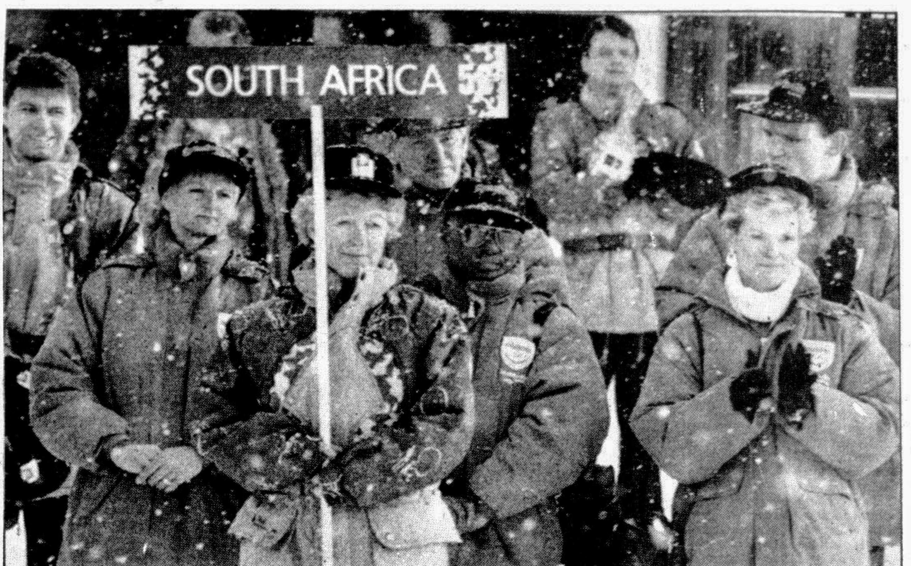
Delegates from the South African team attend the flag raising ceremony of the XVII Winter Games at the Olympic Village in Lillehammer on Feb 7.

ST. JOHNS, Antigua, Feb 8: Injured England pace bowler Andy Caddick will have a bone scan in Barbados today to determine whether he has suffered a stress fracture of the right leg, reports Reuter.