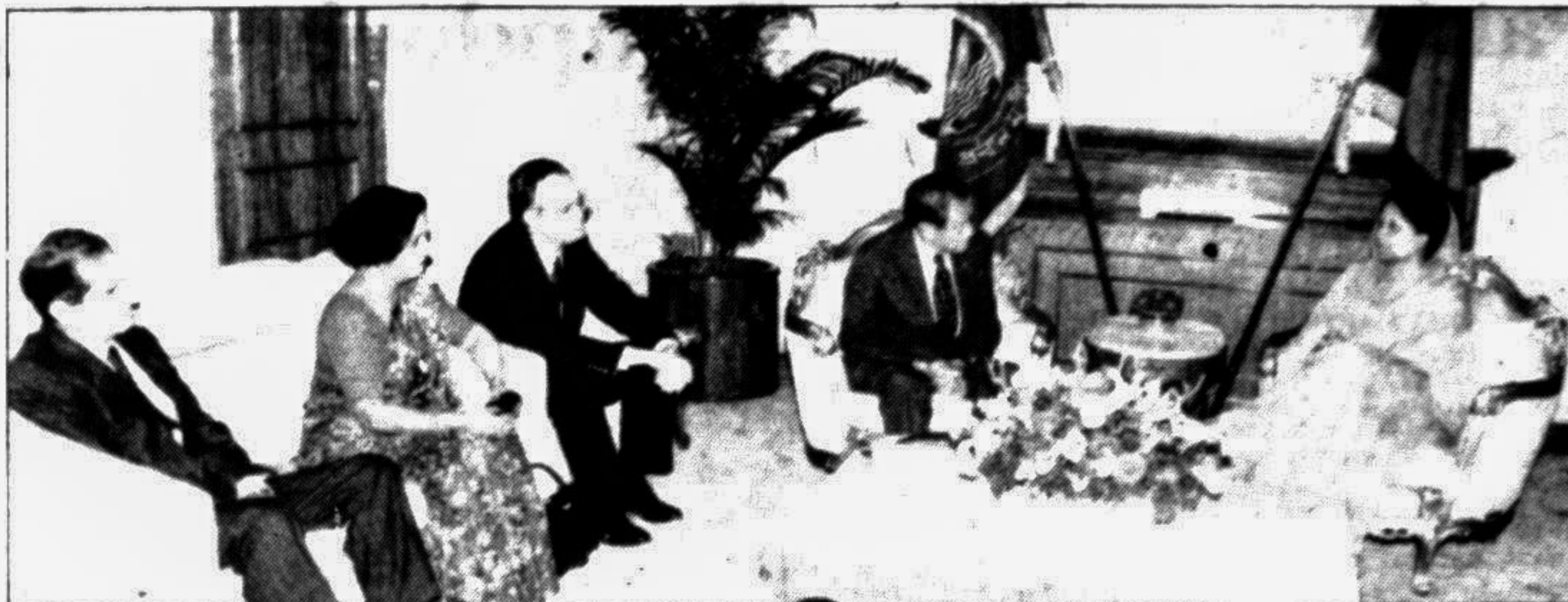
The heads of the United Nations Joint Consultative Group on Policies (UN-JCGP) called on Prime Minister Begum Khaleda Zia at her office yesterday. UNDP Administrator James G Speth, UNICEF Executive Director James P Grant, UNFPA Executive Director Nafis Sadik and IFAD President Fawzi H Al-Sultan are seen on her right.

Begum Zia gave a patient hearing to the members of the delegation and assured them that the convention set by Zia would continue.