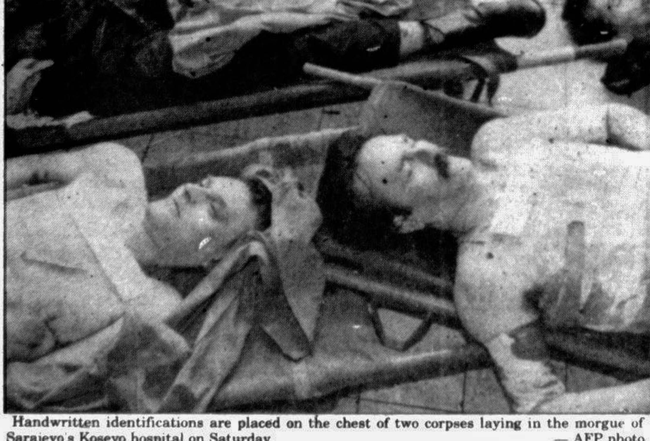
Handwritten identifications are placed on the chest of two corpses lying in the morgue of Sarajevo's Kosevo hospital on Saturday.

Secretary Douglas Hurd condemned the brutal killing of civilians in Sarajevo, adding it underlined the urgency of finding a peace settlement in Bosnia.