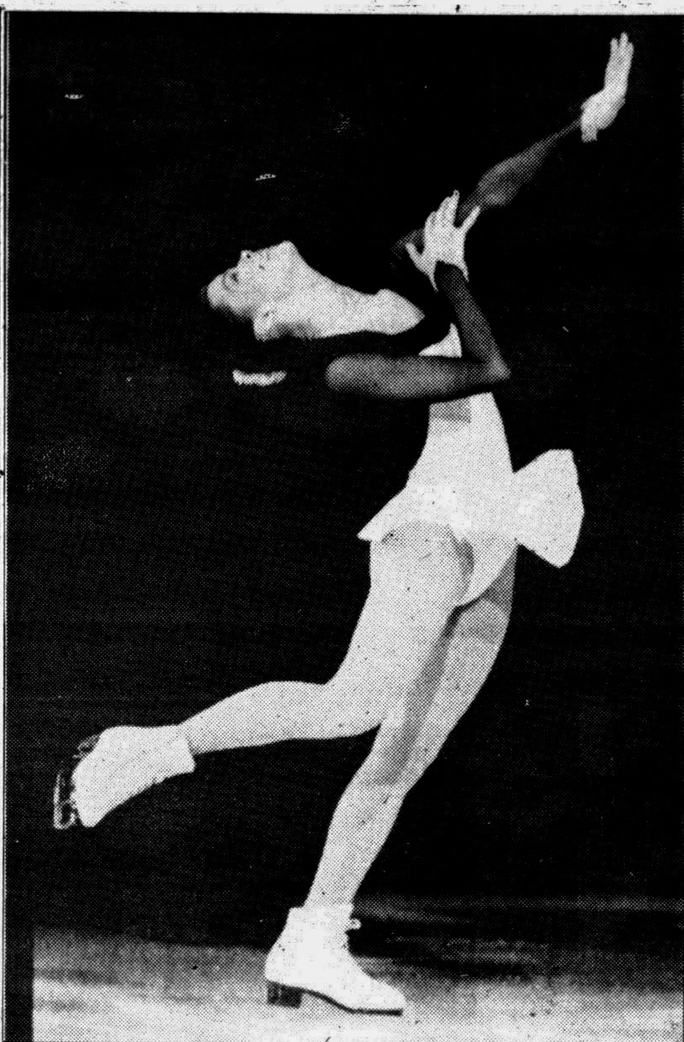
US Olympic figure skater Nancy Kerrigan performs a flawless routine before a sold-out crowd at Boston's Northeastern University on Feb 4. This is Kerrigan's first engagement since she was attacked before the national championships.

Kurmitola Apollo have seven points from six encounters.