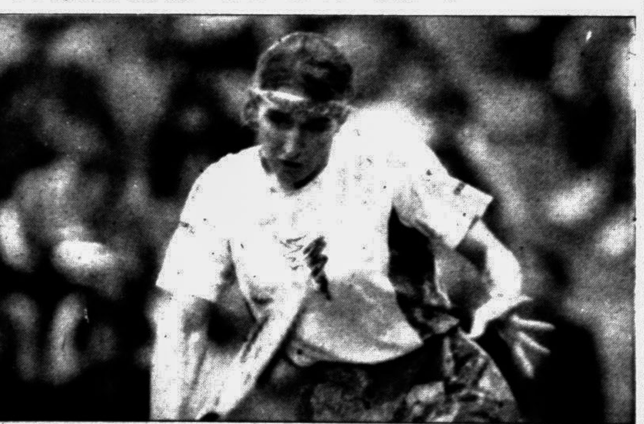
World number one Steffi Graf of Germany plays a backhand-sliced return to Kristie Boogert of the Netherlands in their semifinal match of the Toray Pan-Pacific Open yesterday. Graf defeated Boogert in straight sets 6-2, 6-2.

Maleeva-Fragniere received the bouquet of flowers after the match and she thanked the Japanese spectators — about 8,500 of them — for their support and encouragement when she played in Japan.