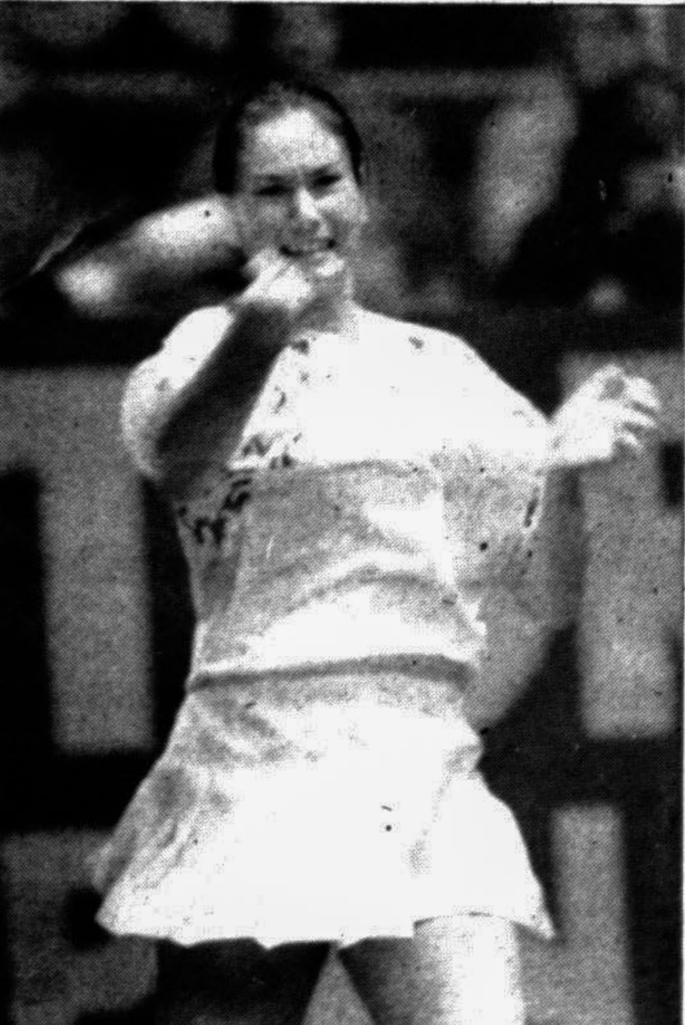
Germany's Marketa Kochta plays a forehand return to Gabriela Sabatini of Argentina in their second round match of the Toray Pan Pacific Open in Tokyo on Feb 3. Kochta defeated Sabatini 7-6 (8/6), 7-5.

Her game, she said, was starting to come together at the right time as she lifted a notch from her second-round performance and began to string together her first serves.