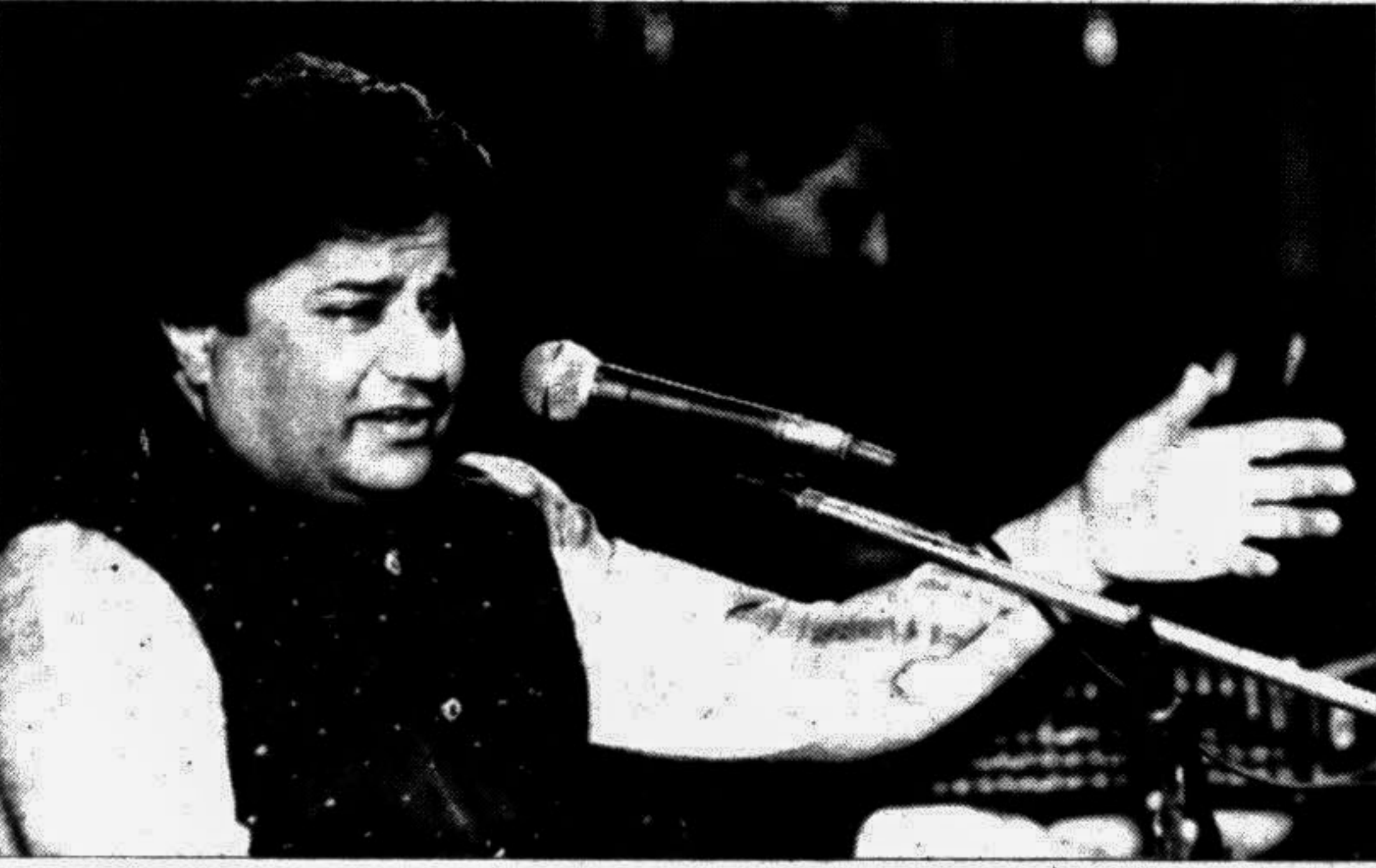
Ghazal maestro Anup Jalota performing at the Sheraton Hotel yesterday evening. The Bangladesh Tobacco Company organised the performance.