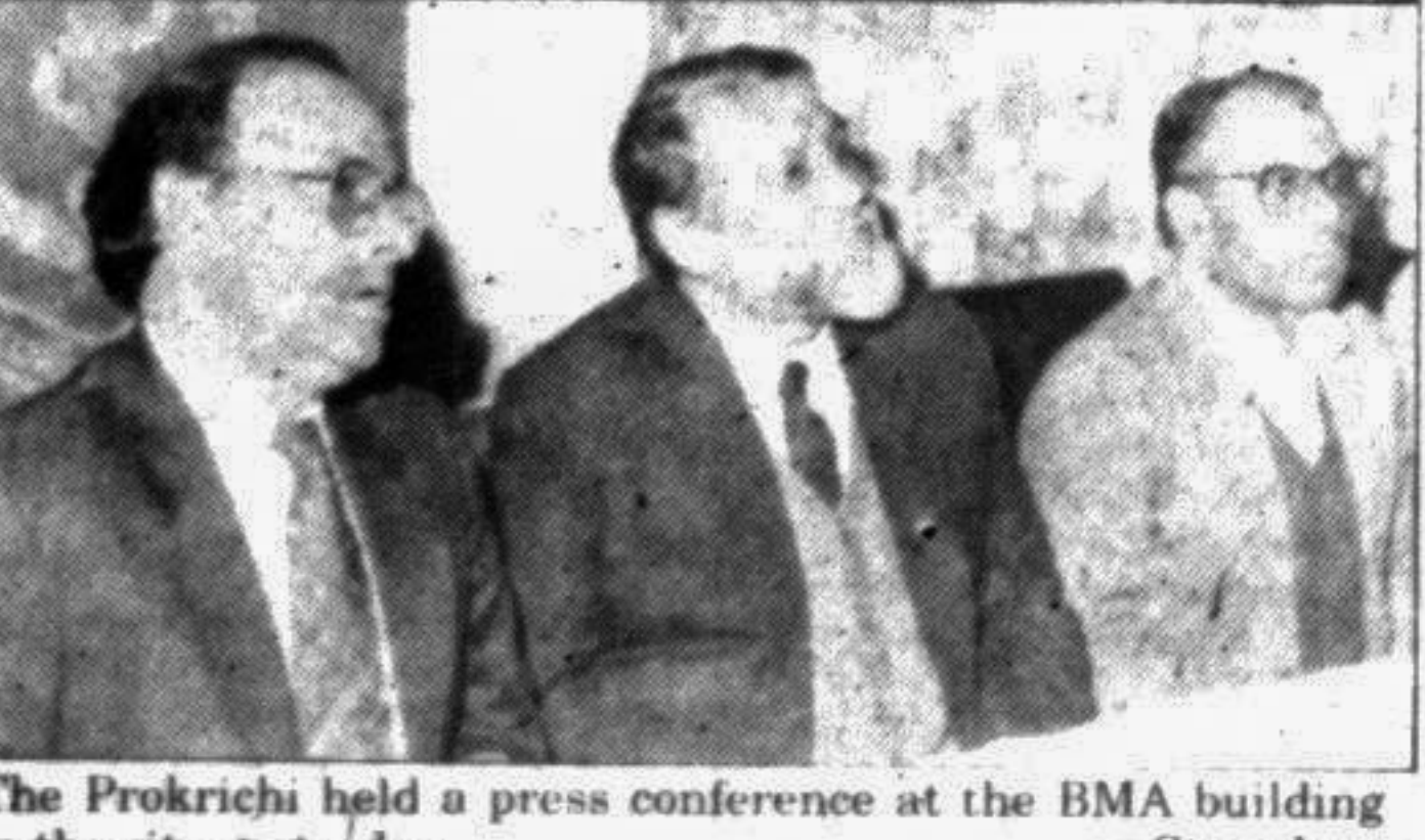
The Prokrichi held a press conference at the BMA building in the city yesterday.