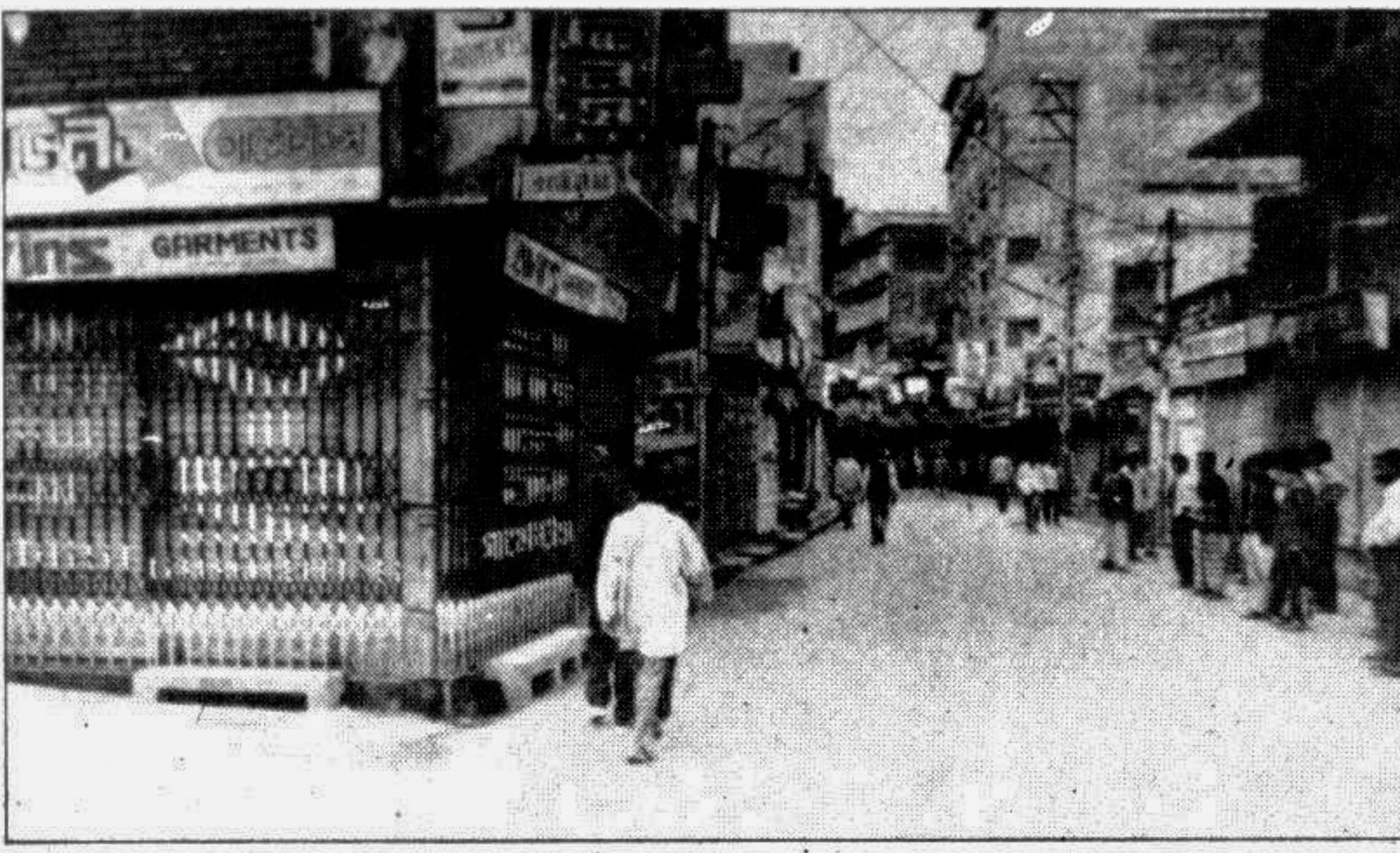
Residents and businessmen of Chawkbazar, Nawabpur, Urdu Road, Lalbagh and Nawabganj areas in the city observed a six hour strike yesterday demanding arrest of the persons responsible for Monday's killing.