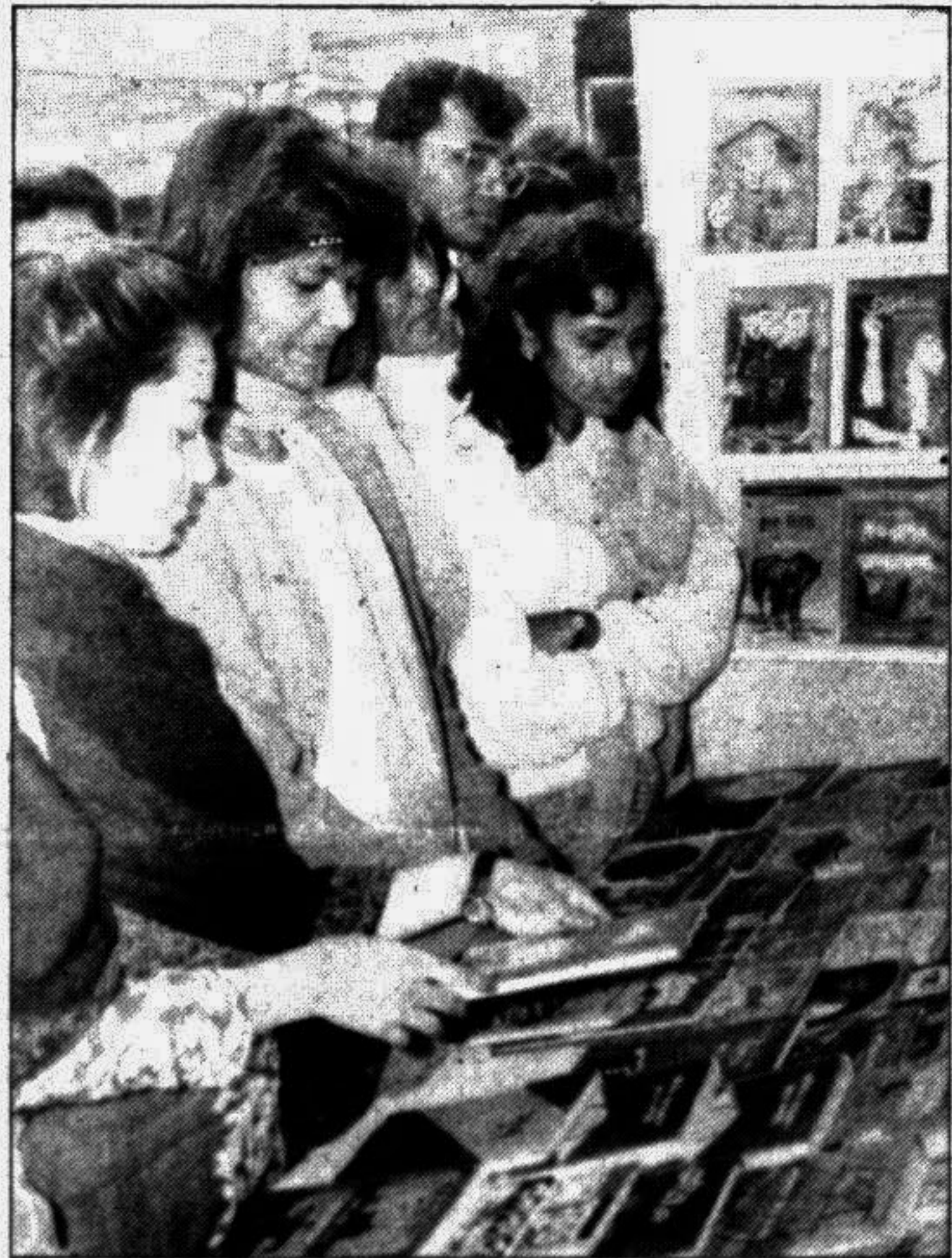
Visitors at an Ekushey Book Fair stall at the Bangla Academy premises in the city yesterday.