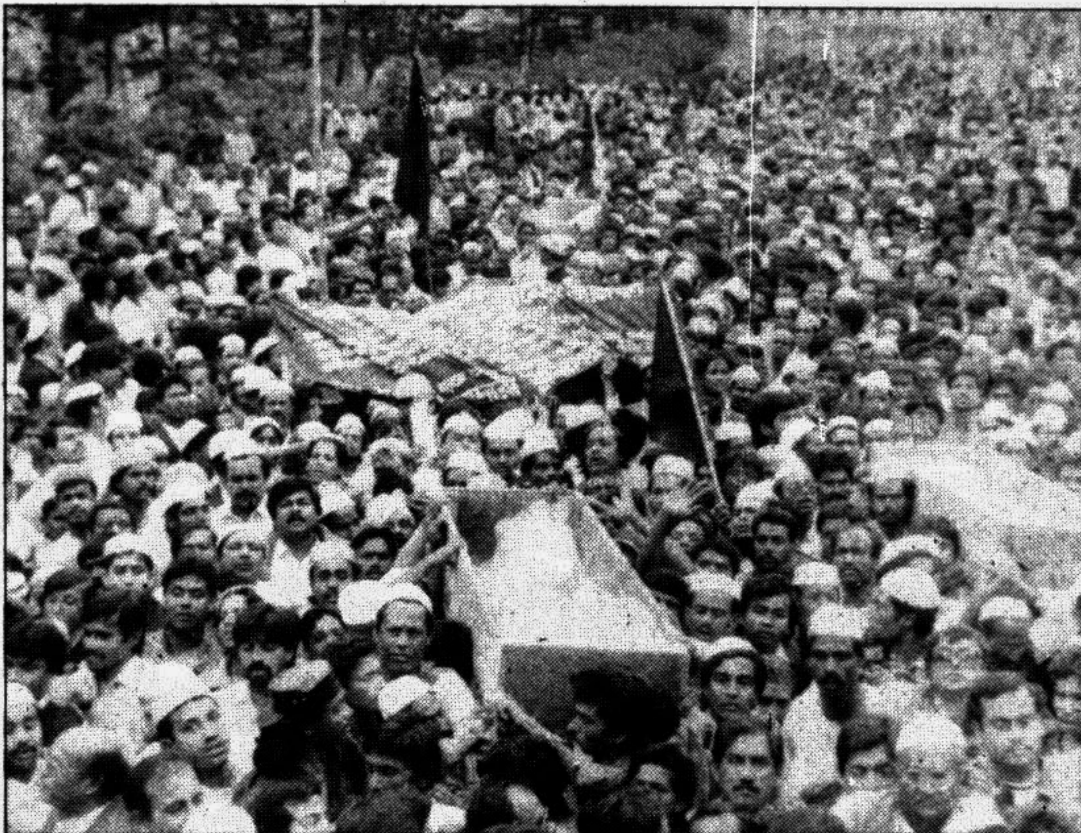
Mourners carrying the coffins of the six who were killed in a post-election violence in the city's Lalbagh area Monday, after the Namaz-e-Janaza at the Baitul Mukarram Mosque yesterday.