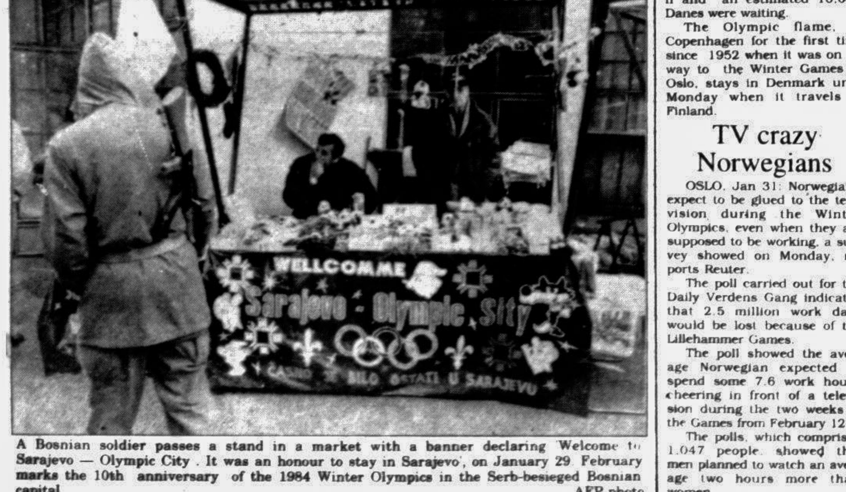
A Bosnian soldier passes a stand in a market with a banner declaring Welcome to Sarajevo - Olympic City. It was an honour to stay in Sarajevo, on January 29 February marks the 10th anniversary of the 1984 Winter Olympics in the Serb-besieged Bosnian capital.