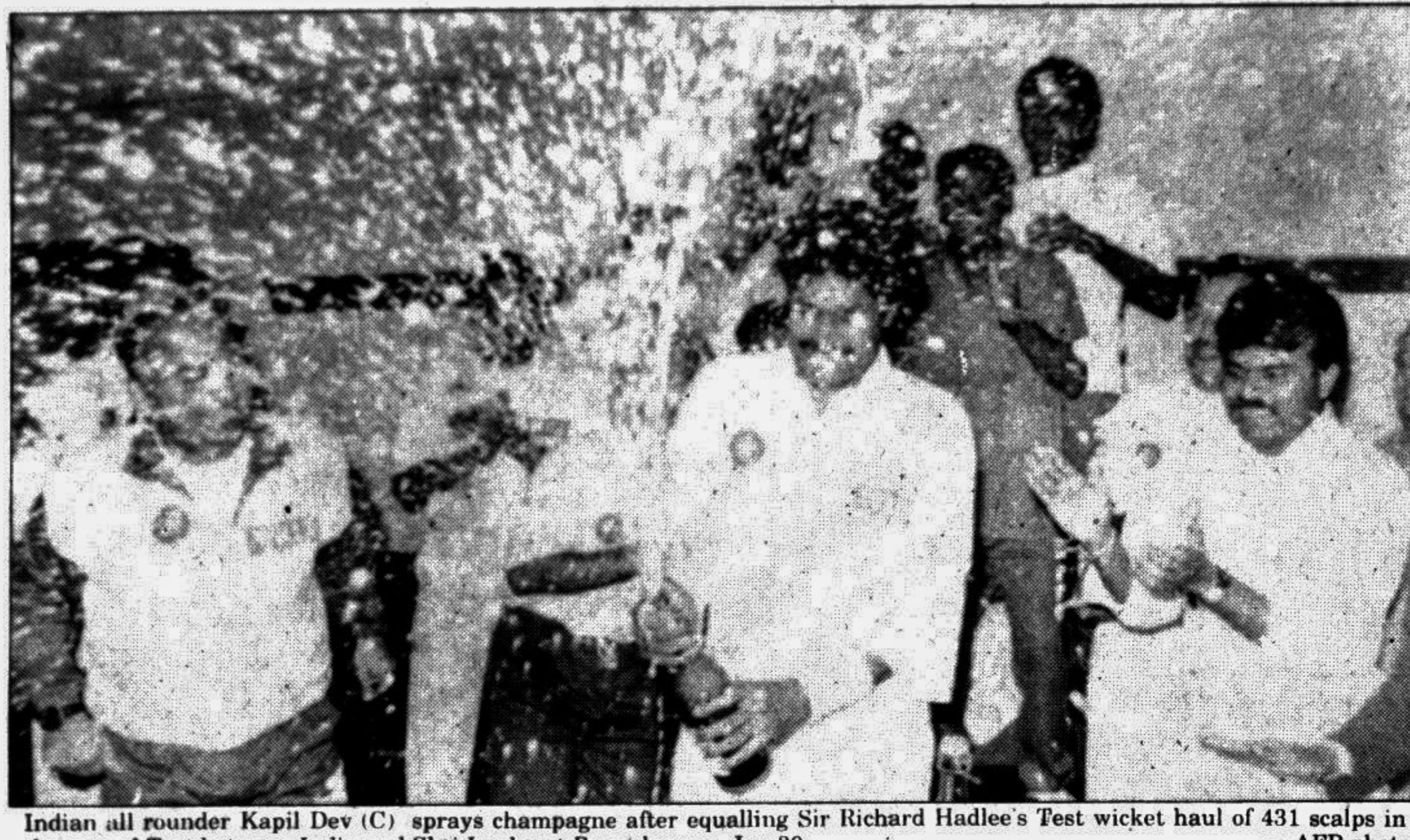
Indian all rounder Kapil Dev (C) sprays champagne after equalling Sir Richard Hadlee's Test wicket haul of 431 scalps in the second Test between India and Sri Lanka at Bangalore on Jan 30.