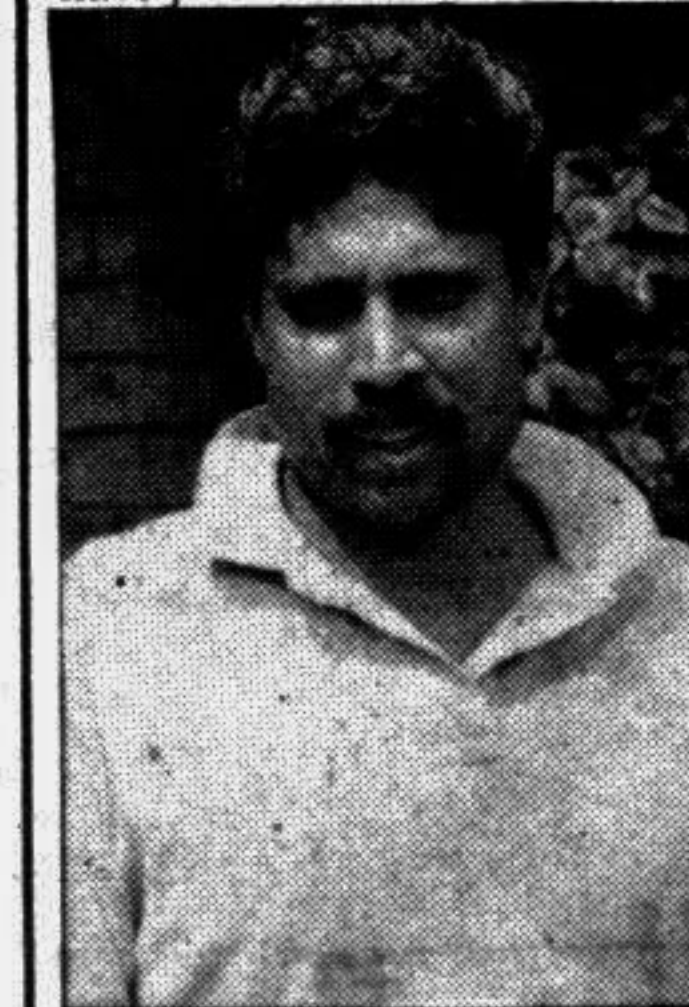
SIR RICHARD HADLEE

"I don't know what tears are these — of joy or what — they have just trickled down."