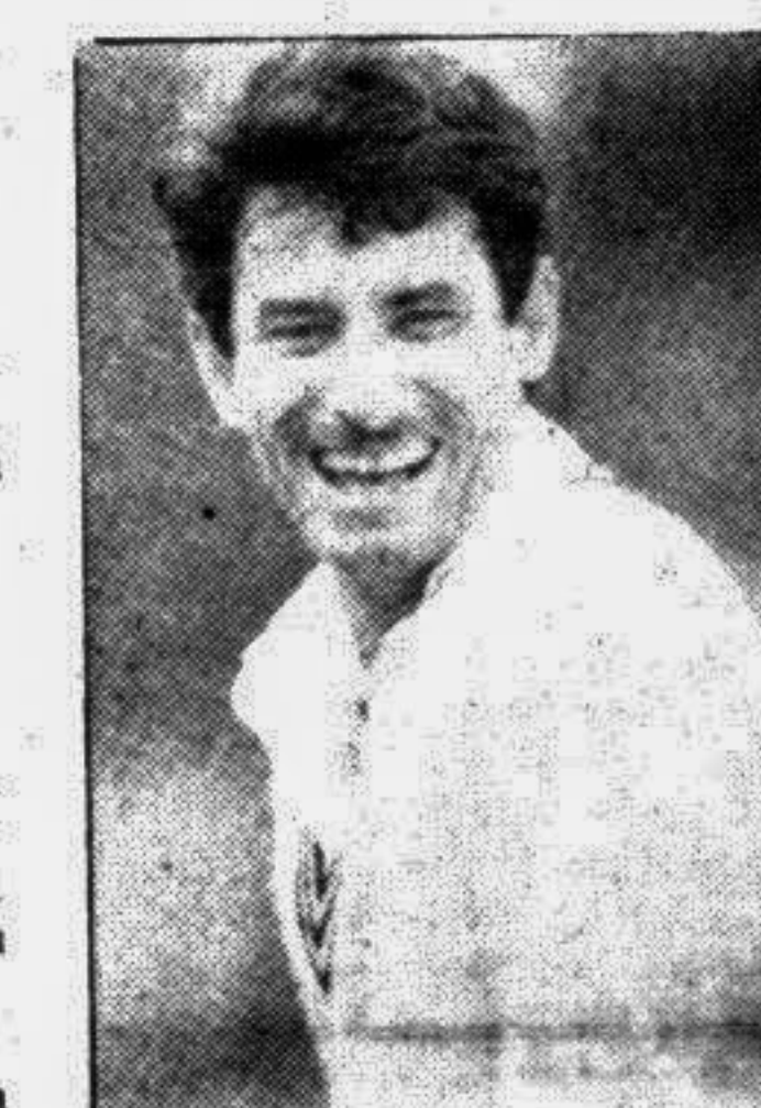
SIR RICHARD HADLEE

"No plans at this stage. I cannot decide on that just now. I will sit with my family and think about it," the legendary hero of Indian cricket said.