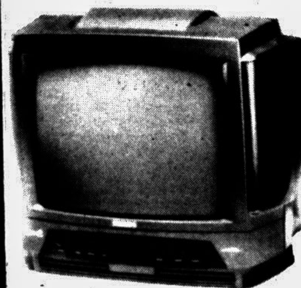
14" CTV with Remote Control