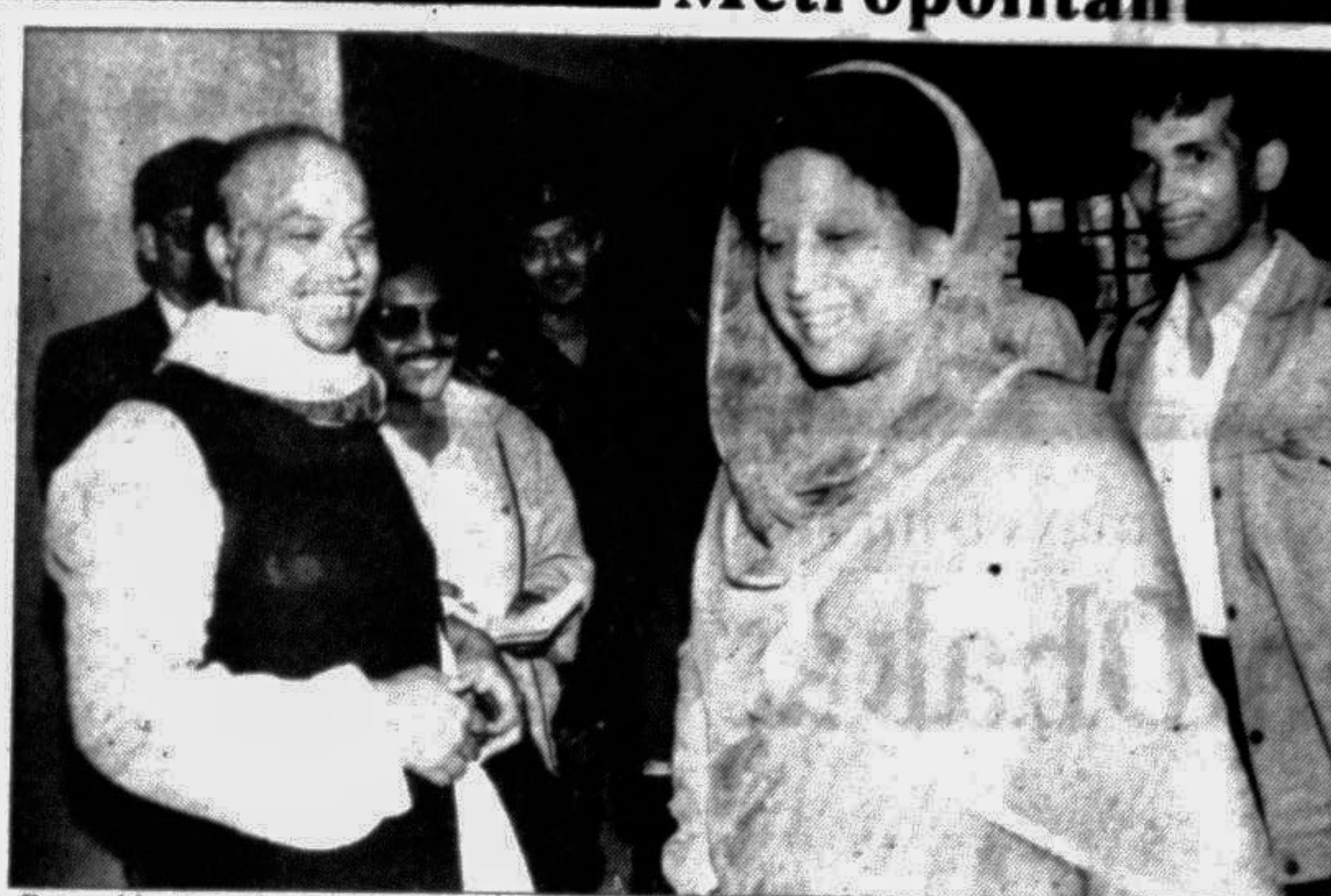
Prime Minister Begum Khaleda Zia talking to the Chief Whip of the Opposition Mohammad Nasim, MP, while visiting the Titumir College polling centre in the city yesterday.

21000 Sft. Office Space available from April '94 for rent with excellent underground parking facility preferably for Foreign and International Organisation at 12-14 Gulshan North Commercial Area. Each floor 7000 Sft. Tel : 610238, 230872, 232416