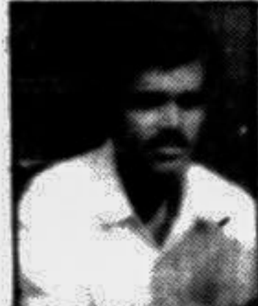
"Paan Banaras Walla" Page 3