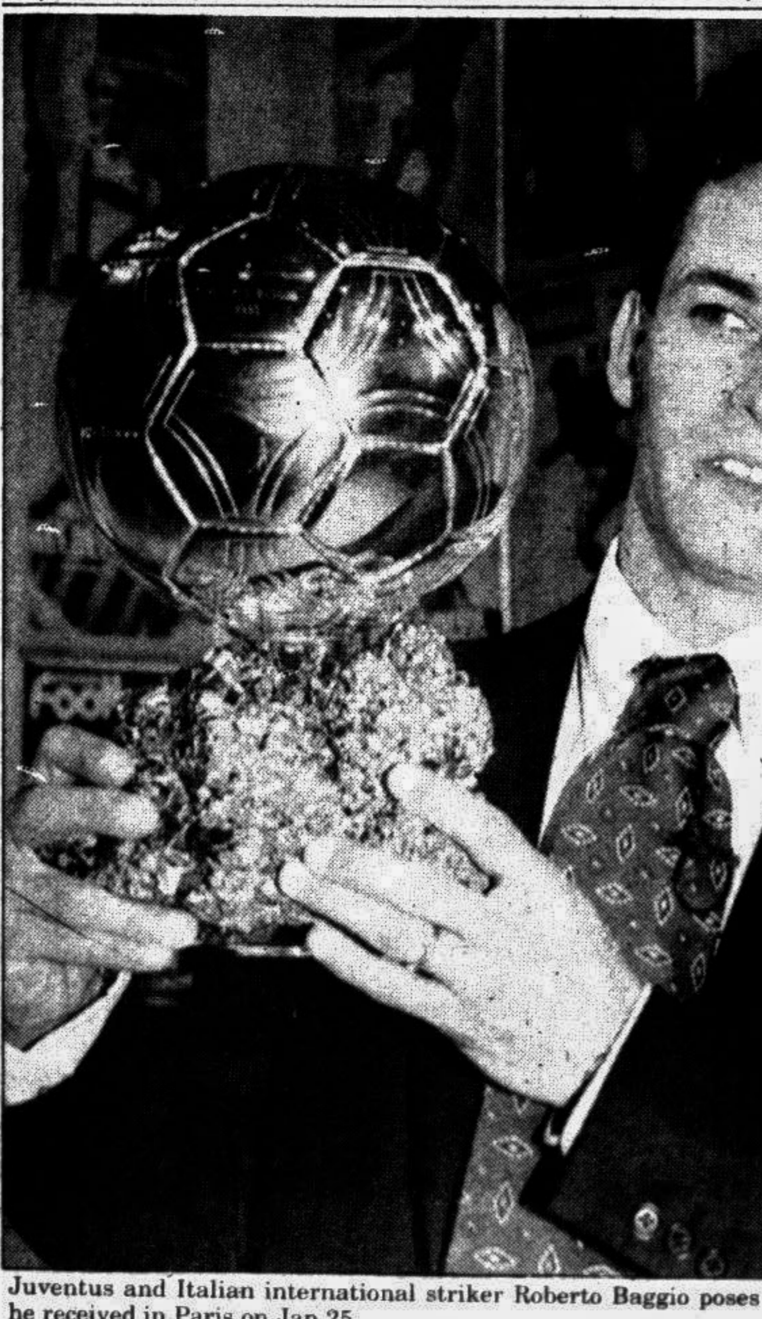
Juventus and Italian international striker Roberto Baggio poses with the Golden Ball award he received in Paris on Jan 25.

The annual sports of Viharunissa Noon School and College was held at the college premises here yesterday, reports BSS. Health and Family Welfare Minister Chowdhury Kamal ibne Yusuf inaugurated the annual sports meet as the chief guest. State Minister for Textile Abdul Mannan was present as special guest.