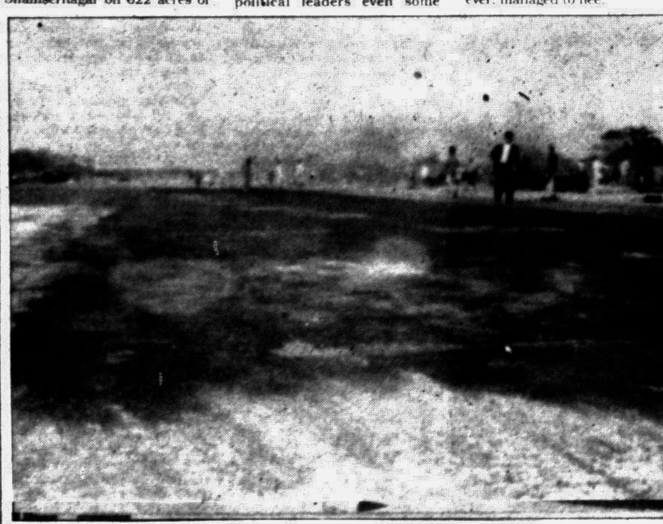
MOULVIBAZAR: A view of Shamsernagar Airport now under construction