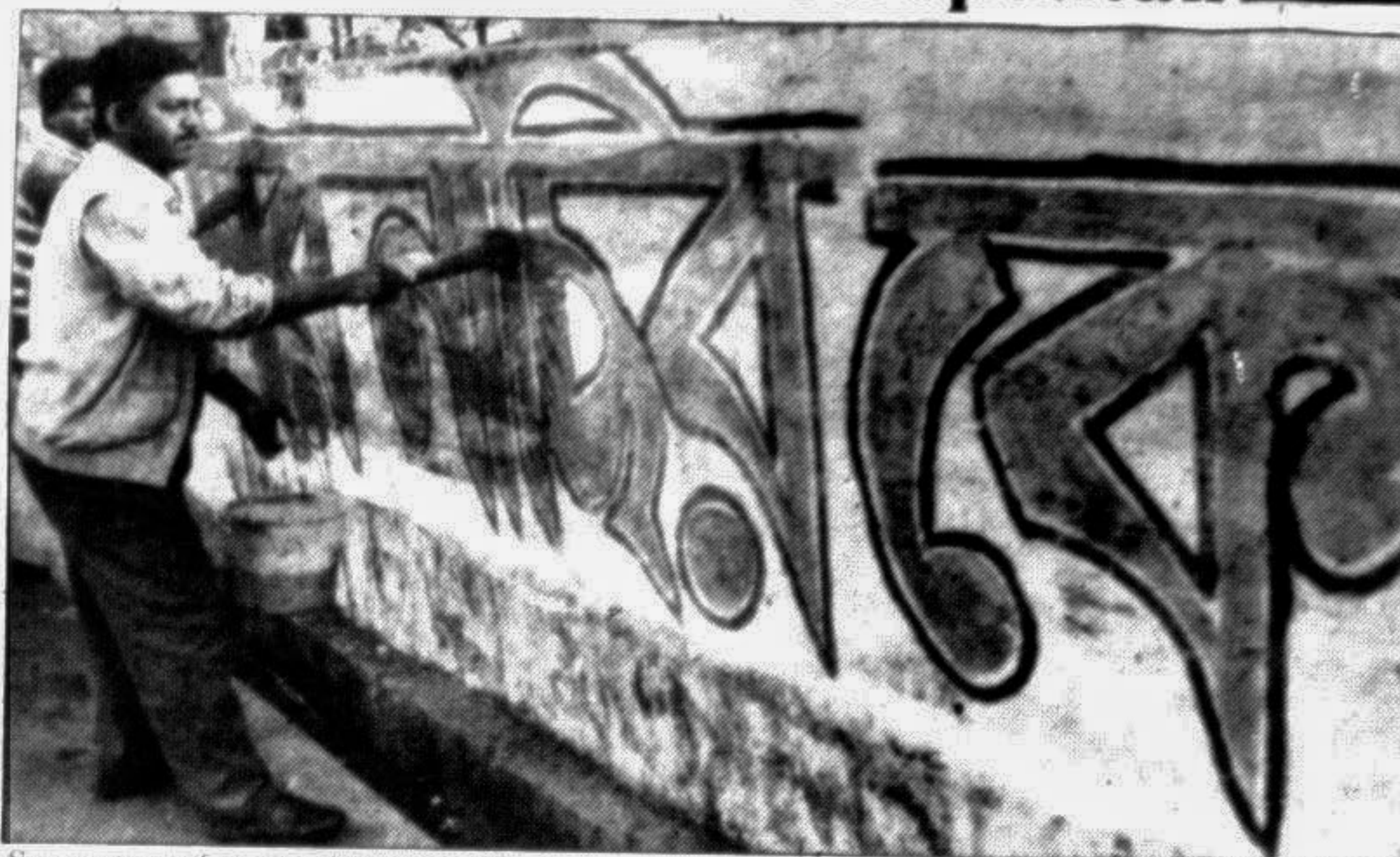
Supporters of mayoral and ward commissioner candidates erasing graffiti as per directives of the Election Commission in Chittagong yesterday.

Qualified candidates should send their resumes within 15 days from the date of this advertisement to Box No :- A-06 C/O Daily Star, Dhaka.