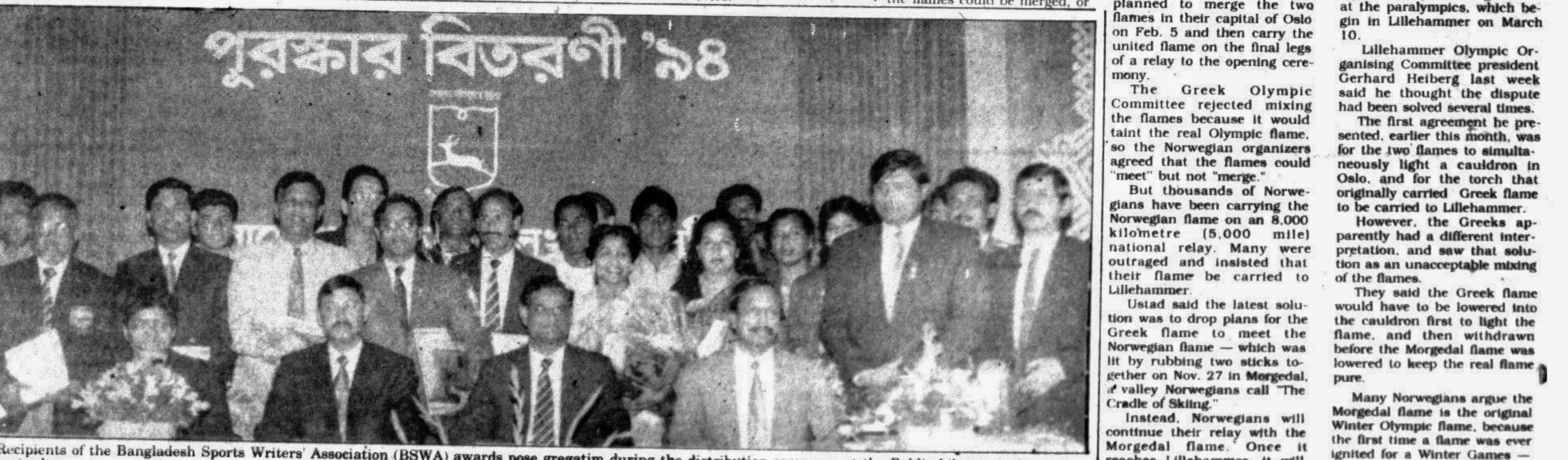
Recipients of the Bangladesh Sports Writers' Association (BSWA) awards pose gregatim during the distribution ceremony at the Public Library Auditorium yesterday.