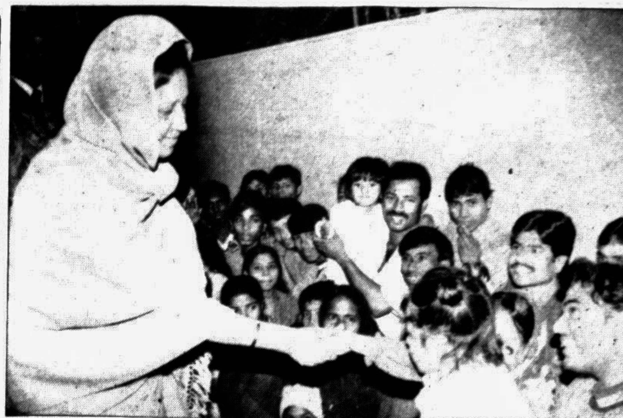
Prime Minister Begum Khaleda Zia shaking hands with a child during her DCC election campaign at Abhoy Das Lane in the city yesterday.

The leaders of the professionals at the meeting also accused the members of the administration cadre of conspiring to jeopardise the country's democracy.