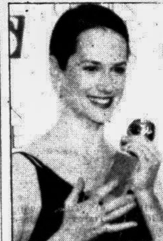
Holly Hunter, best actress (Drama)