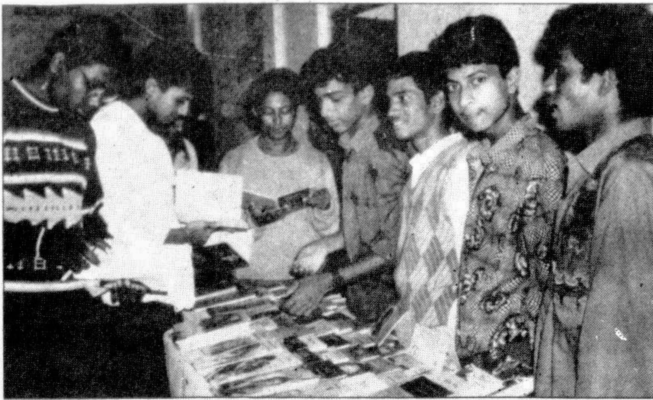
SYLHET: Visitors at a stall in the book fair organised by the local librarians' association recently.

The law-enforcing authorities concerned are yet to take any positive steps to stop the illegal practice of catching fish fries.