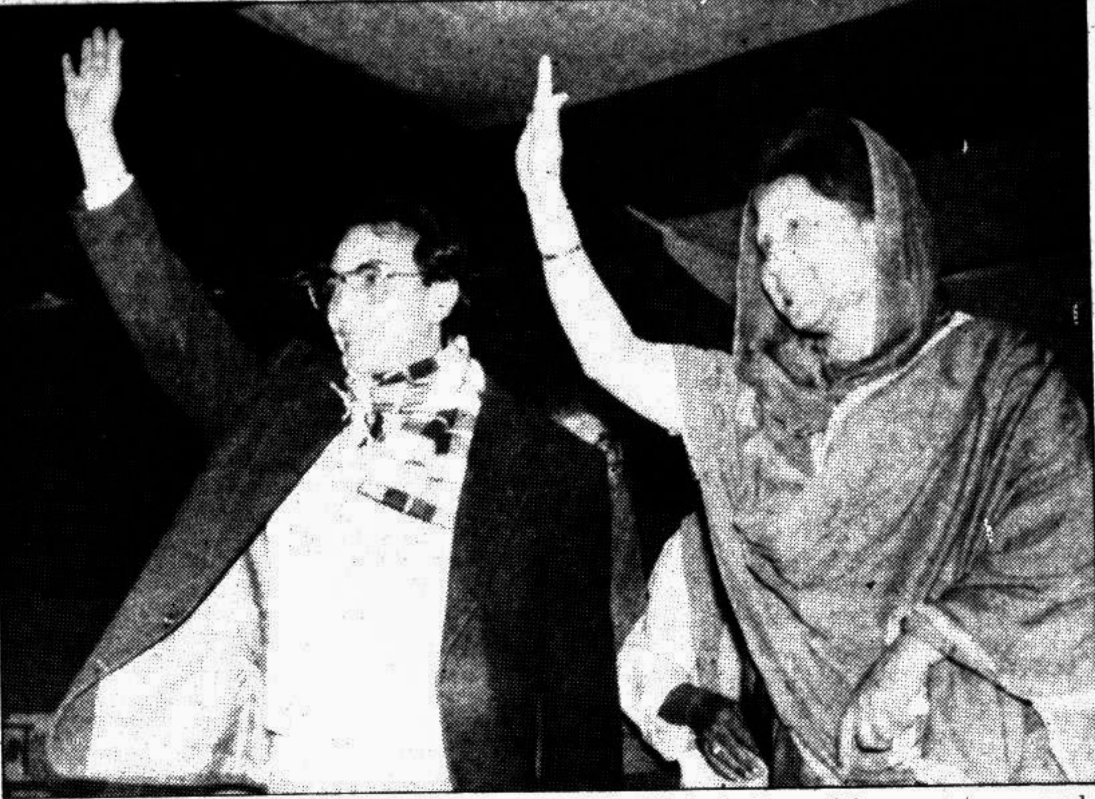
Prime Minister and chairperson of the BNP Begum Khaleda Zia and her party's mayoral candidate Mirza Abbas waving at an election rally at the Khilgaon crossing in the city yesterday.

An armed attack foiled an election rally attended by the Awami League chief Sheikh Hasina at Khilkhet on the outskirts of the city yesterday afternoon. The AL supporters managed to rescue their leader from the showers of brickbats and put her on board her crimson Nissan Patrol jeep at around 4:45 pm. The jeep of the AL chief was damaged before it drove off following the violence. According to witnesses, the trouble erupted at around 4:30 pm when the AL general secretary Zillur Rahman urged the local people near the Khilkhet level-crossing to refrain from voting for an independent commissioner candidate — Md Rafiq. A missile of chairs landed on the podium near Sheikh Hasina. Hasina, who joined the Khilkhet rally on her way back from Azampur, was immediately shielded by her party colleagues on the stage. A section of the audience, allegedly supporters of Rafiq, retreated to the bazaar area of Khilkhet — yards from the meeting venue. Rafiq's supporters started