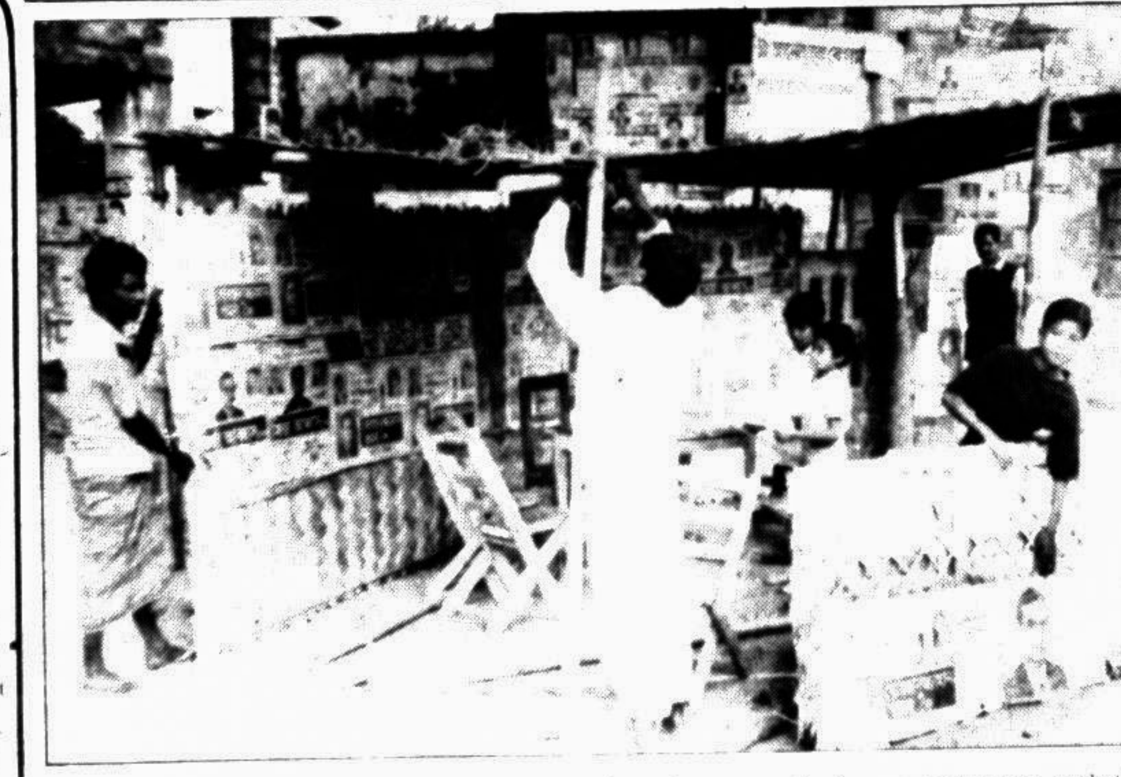
An election campaign stall is being dismantled in the city yesterday in conformity with the Election Commission's directives.