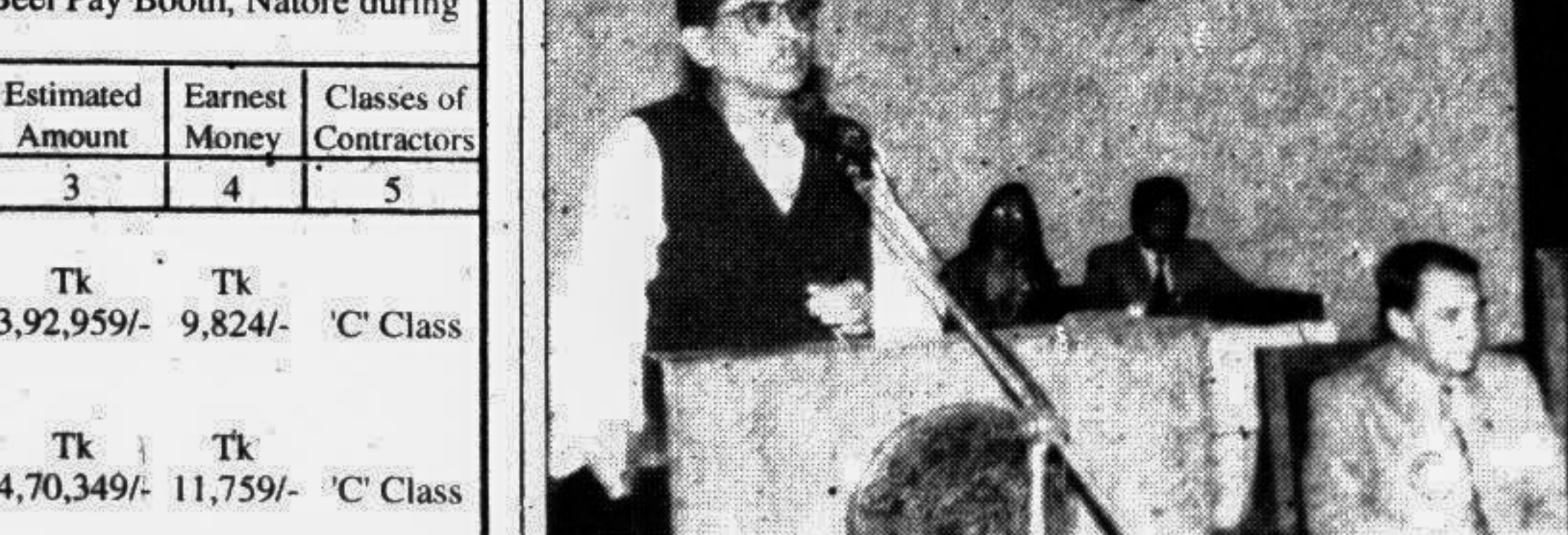
Rashed Khan Menon, General Secretary of the Workers Party, speaking as guest of honour at the SOBA (Shibpur Old Boys' Association) lecture organised by the Institute of Engineers at its auditorium on the occasion of its 38th annual convention.